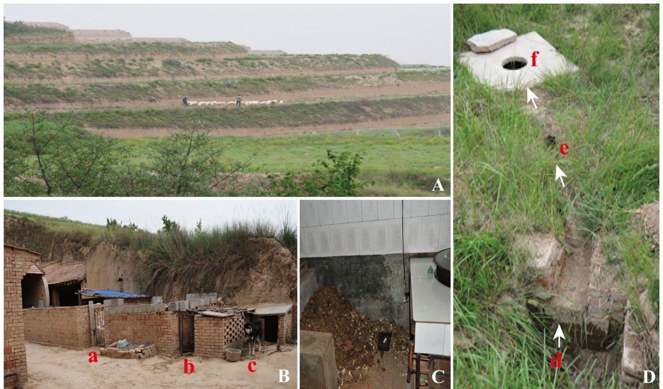
Figure 2. Households and transmission environment of echinococcosis in Xiaonangou township. (A) Grazing sheep in grassland, (B) Stalls rearing domestic animals adjacent to the house for (a) sheep, (b) chicken and (c) dog, (C) Cow dung stored in corner of kitchen as fuel supply for cooking, (D) Water cellar for collection of rainfall as drinking water for farmers and animals (d) inlet of rainfall collection pool for sedimentation, (e) water flow channel, (f) an opening of reservoir well for water uptake. The arrows indicate the water flow direction downwards from a higher position (d) through (e) to reservoir well (f) when the water overfills the collection pool.

intervention was available at the hospitals in Lanzhou City, the capital of the province. When indicated, the local health care workers will arrange the surgical treatment.