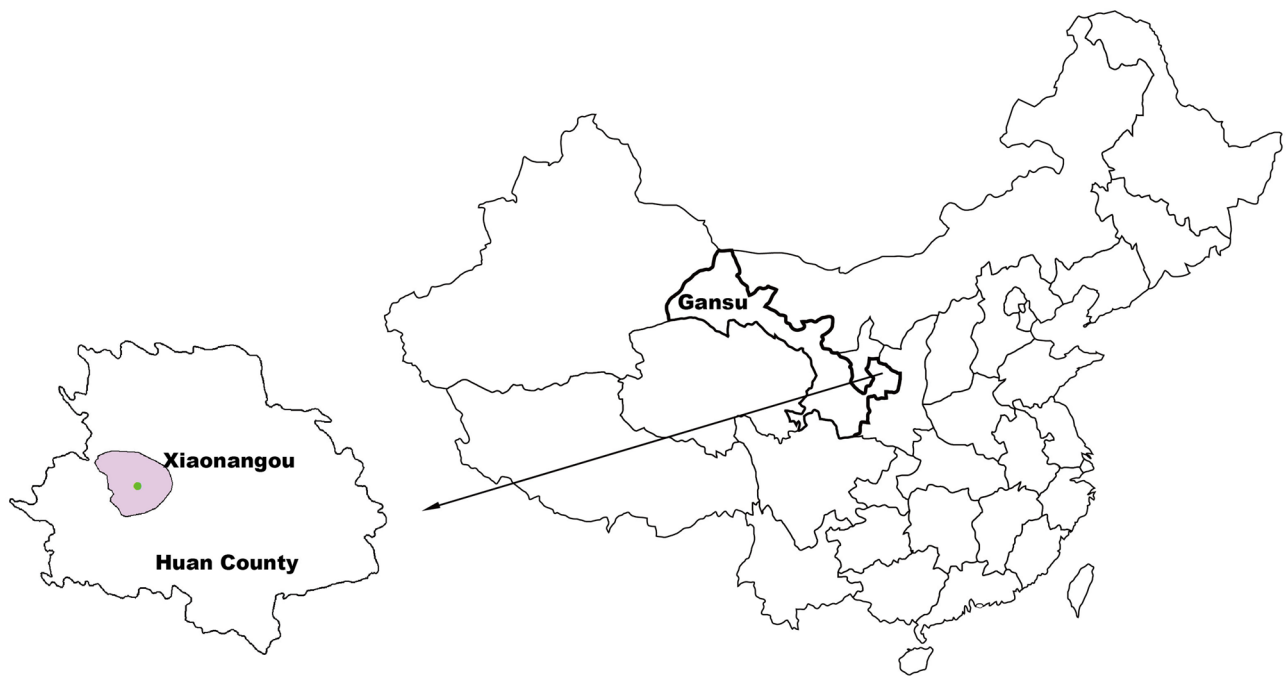
Figure 1. Map of the study location in Huan County, Gansu province of China. The green spot indicates the survey site Xiaonangou township. The map was generated in-house (the base map is available online http://d-maps.com ) and was modified using Adobe software Illustrator C5.

mately 13,239, among them there are 1000 primary school children, and the local farmers owned approximately 2500 dogs. The majority of the residents engage in farming-pastoral production activity, which is the economic pillar of this region, thus almost every family raises sheep, cattle, chickens, and dogs. Furthermore, enclosed stalls for dogs, cattle, and sheep are set just next to farmer's house. Traditionally, dried cow dung is used as a fuel source for cooking, which is piled in the kitchen (Fig. 2A–C). In addition, the main source of drinking water for residents and animals is the rainfall collected in traditional water cellars, which are built as a rain fall collection setting comprised of a well, drainage channel and an underground sedimentation pool (Fig. 2D). Apparently, the local environment providing chances for direct or indirect contact with animals and the water contaminated with parasite eggs may favor the transmission of echinococcosis.