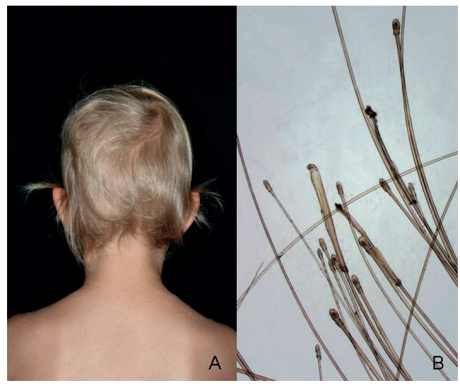
Fig. 1. The girl at the age of 5 years with sparse, fine blond hair (a) with a characteristic telogen hair root pattern in the trichogram (b) with up to 70% telogen hairs (normal rate < 20%).

At 9-years of age, the patient presented for a follow-up visit with continued hair growth abnormalities. Conspicuously, only the central maxillary incisors had presented (Fig. 2a). The intraoral examination revealed complete primary dentition; the orthopantomogram (OPG) (Fig. 2b)