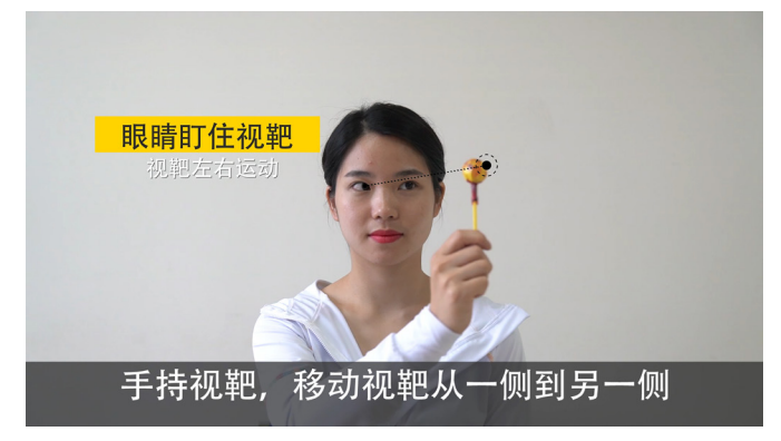
Figure 2 Screenshot of head movement exercises in the training video.

Participants in Group B (betahistine group) will be prescribed betahistine 12 mg (manufactured by Wei Cai China Pharmaceutical Co.) (two tablets taken two times per day for 4 weeks). Participants will be asked not to take any other types of antivertiginous medicine during the course of the study; in such a case, the patient should inform his/her ENT specialist. The pharmacy department of the study hospital will be responsible for dispensing betahistine to each participant. There are 30 tablets in one prescription package. Four packages will be prescribed at the commencement of treatment. During the first two follow-up visits (2 and 4 weeks post-randomisation), participants will be asked to bring their drug packages and the specialist will count the remaining tablets; if the participant fully adheres to the protocol, eight tablets should be left at the fourth week follow-up visit.