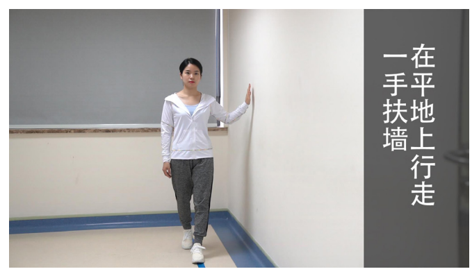
Figure 3 Screenshot of gait exercise in the training video.