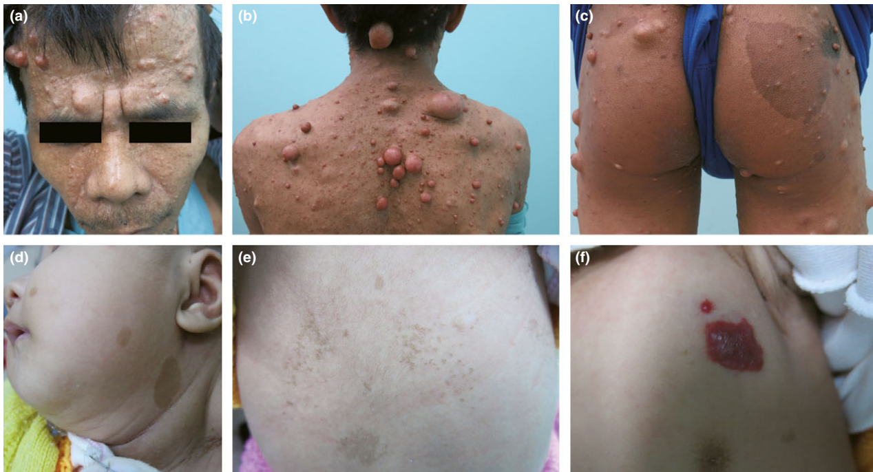
Figure 2. Clinical manifestations of patients with neurofibromatosis type 1 in the Chinese family. The 38-year-old proband of the family presented cutaneous neurofibromas on the (a) face and (b) back. (c) A giant café-au-lait (CAL) macule, with a diameter of 15 cm, on the proband's right hip. The 14-month-old girl showed CAL spots on the girl's (d) neck and (e) abdomen. (f) Hemangioma was also observed on the girl's left chest.

The proband was a 38-year-old man born with café au-lait (CAL) spots without mental retardation. Axillary skin fold freckling was present at the age of 7 years. At the age of 17 years, he developed subcutaneous neurofibromas, which gradually became prominent and widespread over time (Fig. 2a,b). Another characteristic feature was a giant CAL macule of 15 cm on his right buttock (Fig. 2c). The proband's daughter was 14 months old. She was born after a normal pregnancy of 40 weeks, through an instrumented vaginal delivery with a birthweight of 3830 g . CAL spots were present on her face,