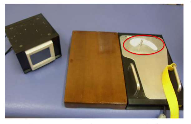
Fig. 1 Push-type toe-grip strength meter. Toes press the floor, facing the strain gauge installed in the cantilever (red circle)

TGS was measured using the push-type toe-grip strength meter (Fig. 1) [13]. Using the strain gauge installed in the cantilever, the device measures the strength of the toes pressing the floor. For the measurement, a foot was placed on the positioning bar of the device and strapped tightly to restrict upward motion during measurement. The measurement was started after the confirmation of zero on the device's screen. The second foot could be measured by turning the measurement board upside down. We measured all the TGS values before and after the exercise program in both upright and sitting positions. In the upright position, patients stood upright on the measurement board facing forward. Special care was taken not to have the patient's head down, causing extra weight to be placed on the toes. During measurement in the seated position, patients sat on a chair adjusted to their height with their