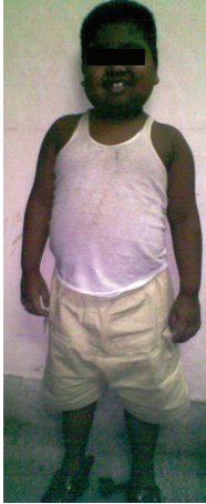
FIGURE 1: Typical appearance of Cushing's syndrome (note moon face and abdominal distension).