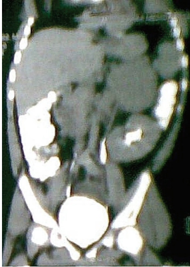
FIGURE 3: Contrast-enhanced abdominal computed tomography (CECT) scan in axial view revealed a large, well-circumscribed mildly enhancing adrenal mass ( 8 \times 6 \times 5 cm approx.) having few internal calcifications at left suprarenal region, which had displaced left kidney slightly downwards (arrow-mass; triangle-left kidney).