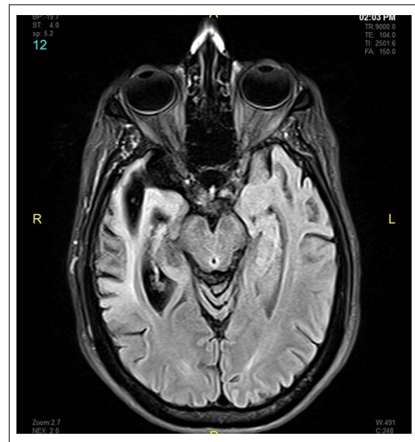
Figure 1. Brain magnetic resonance image fluid attenuated inversion recovery sequence axial image demonstrating asymmetric brain atrophy with right temporal lobe predominance.

Rogalski et al. 6 has identified several factors which could possibly contribute to selective vulnerability of the language network for future developing progressive language impairment, including genetic, developmental and acquired factors, while learning disability could possibly serve as a marker of biological weakness—increased susceptibility for the condition. 7 Primary progressive aphasia is sharing much