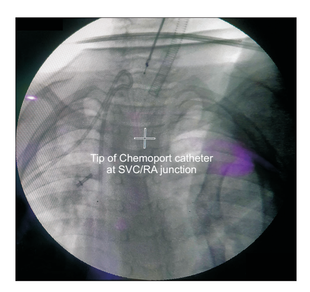
Fig. 1. Fluoroscopic image showing a chemoport catheter with the tip at the right atrium (RA)/superior vena cava (SVC) junction.

Informed and written consent were obtained from the parents of the child. Pre-anesthetic clearance was obtained. Adequate blood and blood products were kept ready, as most of these patients had hematological malignancy with anemia and thrombocytopenia. The children with thrombocytopenia received platelet transfusion just before shifting to surgery. A dose of prophylactic antibiotic was administered at the time of anesthetic induction in the children