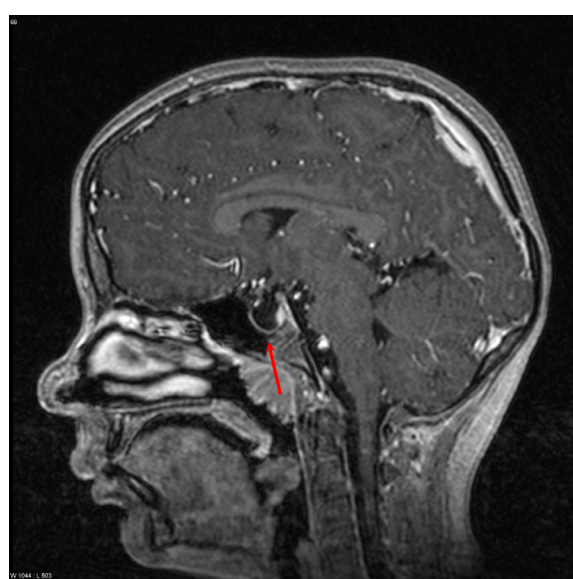
Figure 4 Empty sella. MRI Scan of the brain. Sagittal, T2-weighted. The arrow indicates the empty sella.

The patient is now 13 years and 6 months old. Her height has reached the 3. Percentile (-2,5 SDS)(Figure 1) and stage of puberty is Tanner B2, PH2.