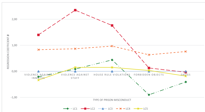
FIGURE 2 | Regression coefficients (B) for several types of prison misconduct by Latent Class. LC3 (n = 109) served as reference group.