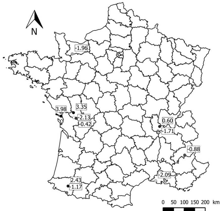
FIGURE 1 Geographical localization of the 11 capture sites sampled in this study

This study was carried out in accordance with all applicable institutional and/or national guidelines for the care and use of animals. All experimental procedures were approved by the "Comité d'Ethique en Expérimentation Animale Poitou-Charentes", France (authorization number: CE2012-7). Permits for the capture, sampling and banding