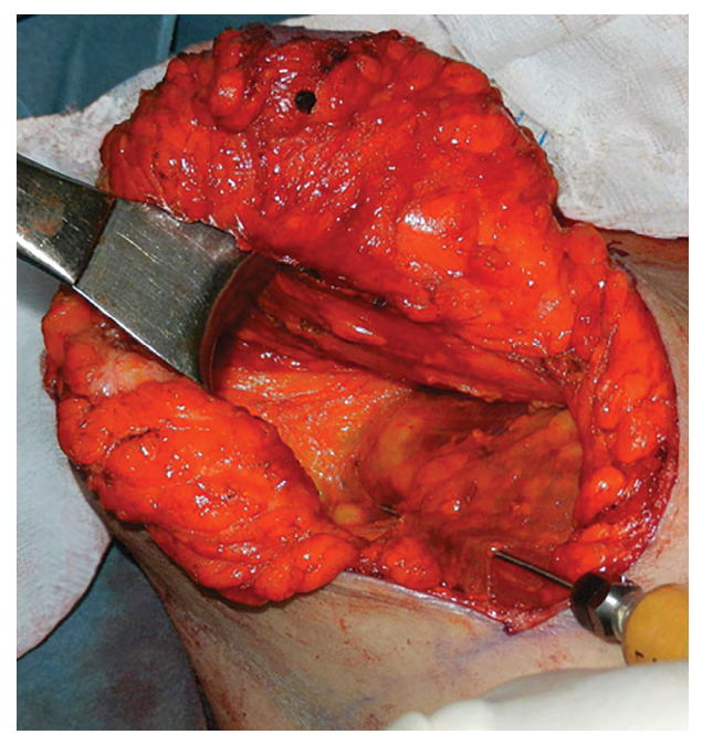
Fig. 3. The graft is placed under the pectoralis major fascia.