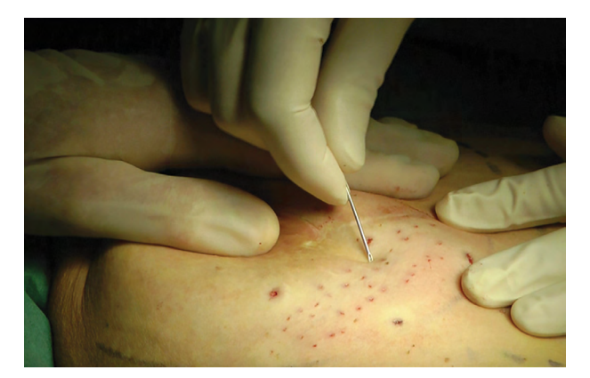
Fig. 1. Percutaneous aponeurotomy with an 18G needle.

The distribution inside each breast should be performed according to the preoperative planning and patient desires. The distribution of the graft into 4 areas