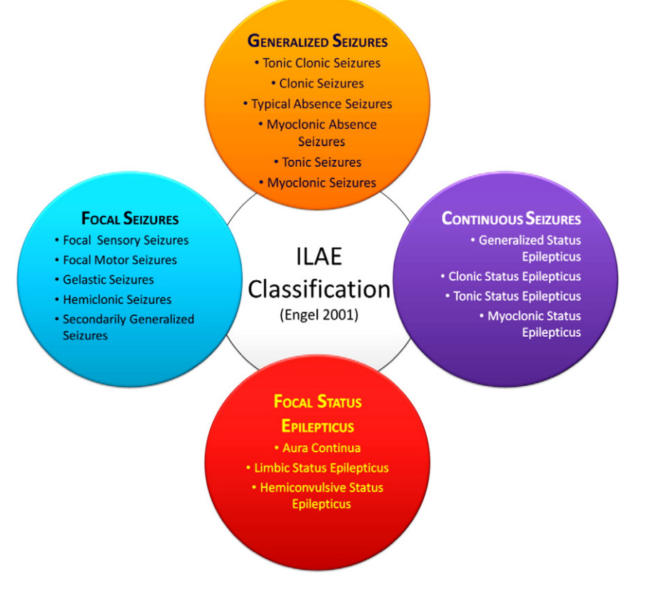
Fig. 1. Epilepsy classification.