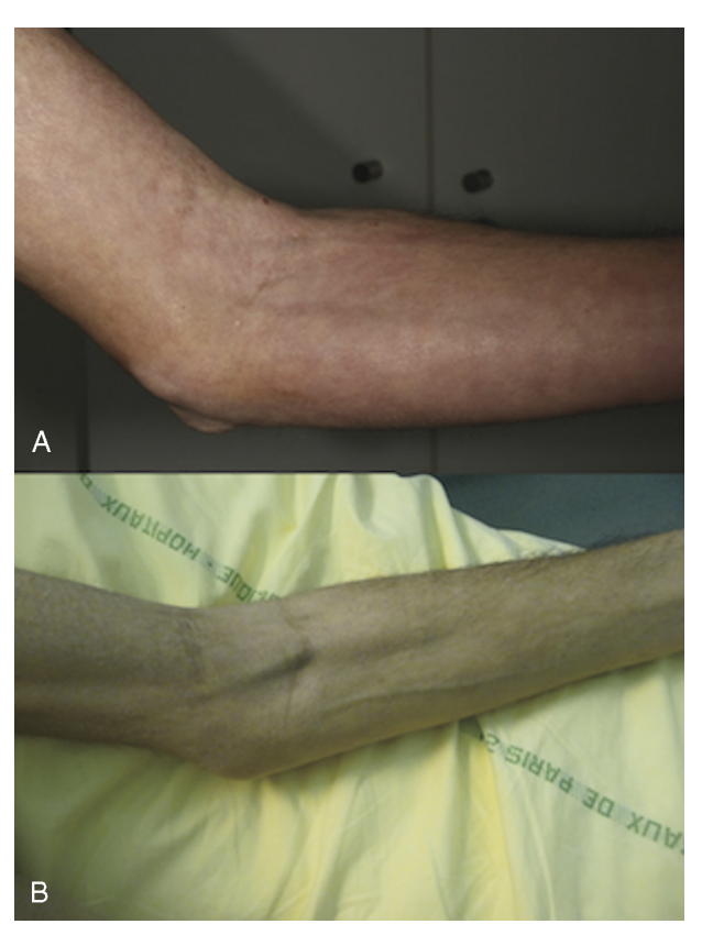
FIGURE 4. Patient 3. Redness, warmth, and woody induration of the skin of the left forearm (top). After 12 months of immunosuppressive therapy (bottom). Marked softening of the skin; veins have become visible. [This figure can be viewed in color online at http://www.md-journal.com].