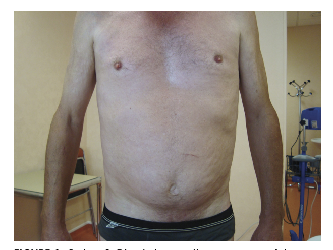
FIGURE 1. Patient 2. Dimpled, peau d'orange aspect of the abdomen. [This figure can be viewed in color online at http:// www.md-journal.com].

After a week of snowshoeing, a 57-year-old farm worker developed asthenia, myalgia, and rapidly progressive thickening of the skin on the trunk and on all 4 limbs. A physical examination revealed diffuse scleroderma, except on his face, with peau d'orange presentation of the abdomen (Figure 1) and thighs and venous furrowing of the forearms. The eosinophil count was 2.6 g/L. Three months after the onset of these symptoms, a fullthickness skin and muscle biopsy from the arm revealed perivascular lymphoplasmacytic infiltration of the hypodermis, fascia, and perimysium, indicative of EF (Figure 2). The patient was discharged on prednisone (1 mg/kg daily). Two months later, he was readmitted with diffuse petechiae and ecchymoses of the lower limbs. His platelet count was 7 g/L, hemoglobin 9.9 g/dL, reticulocytes 55 g/L, leukocytes 1.2 g/L, and neutrophils 0.4 g/L. Bone marrow aspiration disclosed severe hypocellularity (<20%) with a complete absence of megakaryocytes (Figure 3). He received ATG for 5 days, and a daily oral dose of 360 mg CsA was started. The CsA dose was tapered to 200 mg daily 6 months later after the onset of an axonal sensory polyneuropathy of the lower