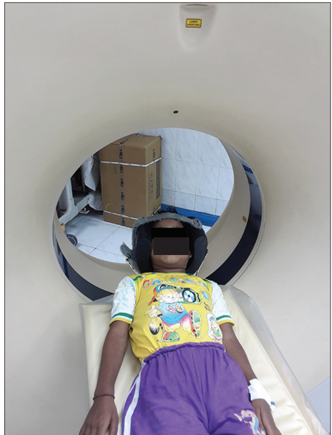
Figure 2: The head immobilizers should be used for children to avoid motion artifacts and repeat scan

Regular audits and quality checks for the equipment must be ensured for optimum performance and calibration for pediatric use.