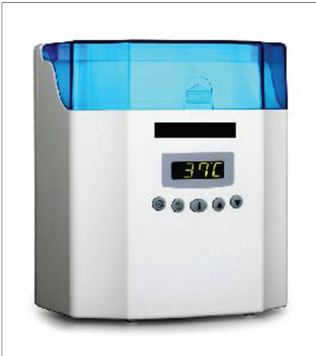
Figure 4: The gel warmers should be used in cold environment to avoid unpleasant sensation

Most common imaging technique employed for evaluation of chest is the radiograph. The challenges in acquiring radiographs include difficulty in achieving inspiration and likelihood of motion blur, wide range of tissue densities, and the need to minimize radiation dose.