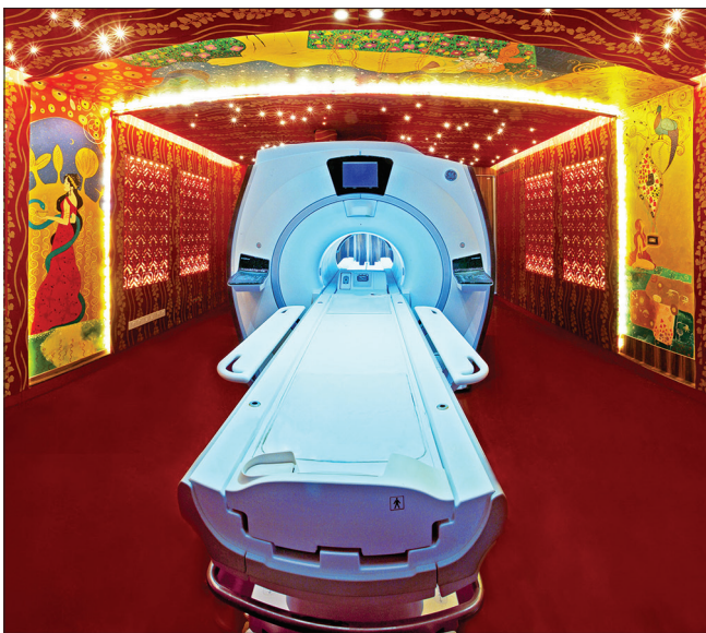
Figure 1: The investigation room and the gantry are colorful. This makes the environment friendly for the children and helps in receiving their cooperation

There must be standardization of the techniques and various protocols used. Child-appropriate protocols should be documented and adhered to for all the modalities. Strict adherence to low-dose protocols can be challenging,