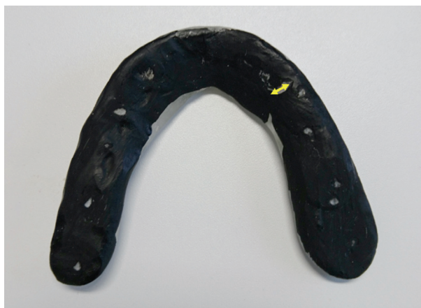
Fig. 1. Occlusal facets present on the appliance. After 2 weeks, the surface texture was assessed, and the lengths of the facets formed by the mandibular canines were measured.

was selected because it combines sufficient strength with the appropriate degree of abrasability (for facet formation). The appliance position was adjusted with canine guidance by grinding. In addition, the appliance contacted all the teeth equally on the centric occlusion. The appliance was adjusted repeatedly over several days until the subject ceased to experience any discomfort. After the adjustment was complete, a marker (Facet Resin Marker, GC Corporation) was applied to allow for easy observation of the surface texture of the appliance. After 2 weeks, the surface texture was assessed and the lengths of the facets formed by the mandibular canines were measured. Fig. 1 shows the length of the facets.