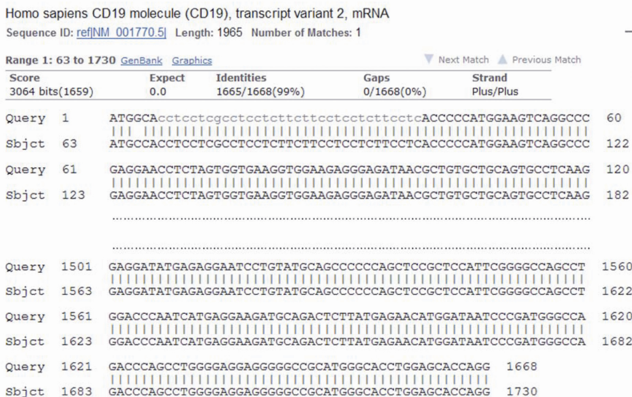
Figure 2. Alignment of amplified cDNA for canonical isoform of human CD19 reference sequence in NCBI database. Comparing the 1701 bp amplified sequence with reference sequence for short isoform (variant 2) of human CD19 showed complete alignment. Only 5' and 3' of alignment has been briefly showed.

cDNA coding for human CD19 was first cloned and described by Tedder et al from human tonsil cDNA library 3 . Located on chromosome 16, CD19 gene codes for a transmembrane protein with exclusive expression in B cell lineage 4-6 . CD19 as a promising tar-