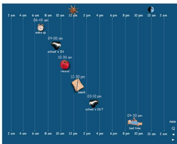
Figure 1 Example of a school day segmented according to school break times.

Some activities require a subjective intensity ranking. These activities are mostly physical activities such as locomotor activities, games and sports that can be performed at a wide range of intensities. In these cases, an intensity screen asks the user whether the activity was performed at light, medium or hard intensity. As children have difficulty understanding the concept of intensity [28], users are asked whether they need any help to decide. If so, a screen will appear that plays videos of children playing a ball game at varying intensities (see Additional File 1). Trost and colleagues [28] and Tremblay and colleagues [29] concur that videos are effective in helping children understand the concept of physical activity intensity. The videos used in the MARCA were initially developed for use in the Computer-delivered physical activity questionnaire (CDPAQ), a self-report questionnaire developed prior to the MARCA and a more thorough description of their development is available in Ridley et al. [20]. Once an activity has been selected, the name of activity, its identifying code, the start and end time, and duration of activity are recorded. Children continue to add activities to their activity list within each segment of the day, until the end of the day is reached.