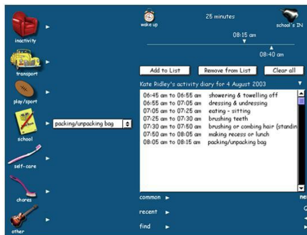
Figure 2 Example of one of the MARCA's segmented day screens.