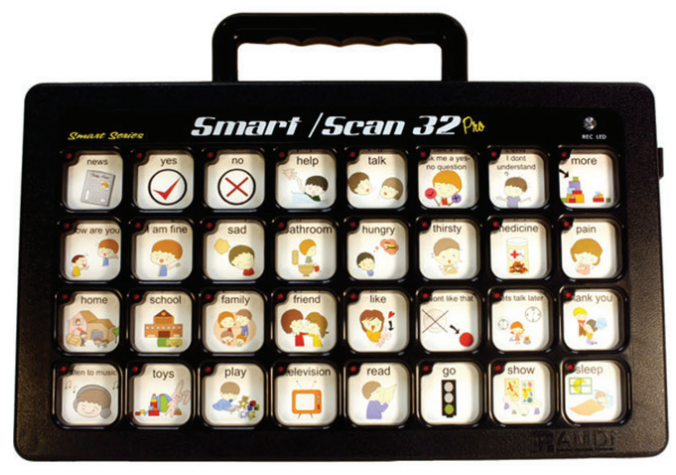
Fig. 1: Smart/Scan 32 pro, an augmentative communication device

Communication guidance helps to establish trust and builds needed cooperation. Oral commands should be short, clear, and simple sentences. It is important to maintain good, ongoing communication throughout the visits