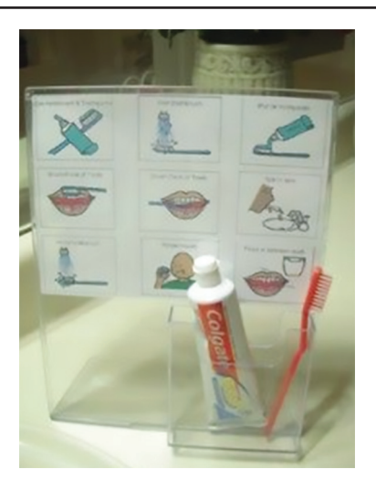
Fig. 3: Visual pedagogy

analyses the antecedents of behavior and consequences that follow.