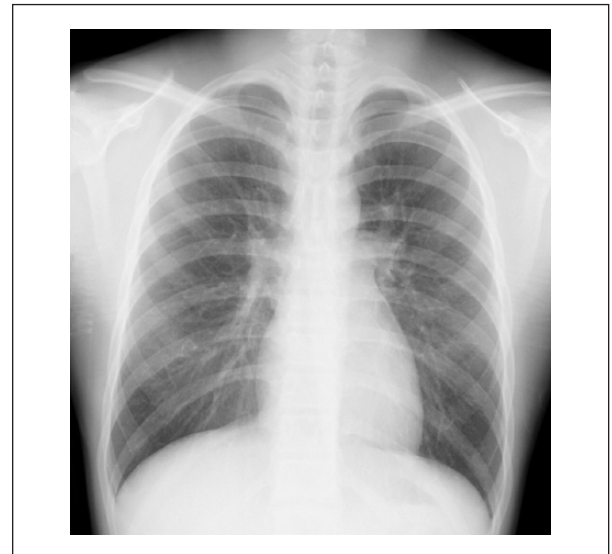
Figure 1. Chest radiograph acquired on admission. The extraluminal free-air density is evident alongside the trachea.

Spontaneous pneumomediastinum with typical history without remarkable physical examinations.