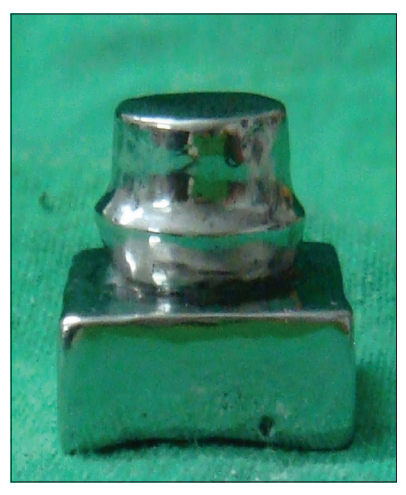
Figure 2: Master model

DMLS technology fuses metal powder into a solid part by melting it locally using the focused laser beam and was builtup additively layer by layer, using layers of