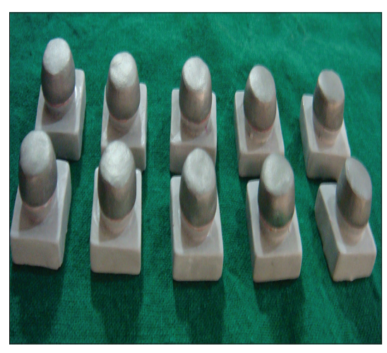
Figure 6: Conventional copings on the working models

After cementation, marginal gap of conventional copings and DMLS copings were measured at four predetermined points (one on midbuccal, midmesial, midlingual, and middistal surfaces). The measurements were made using the metallurgical