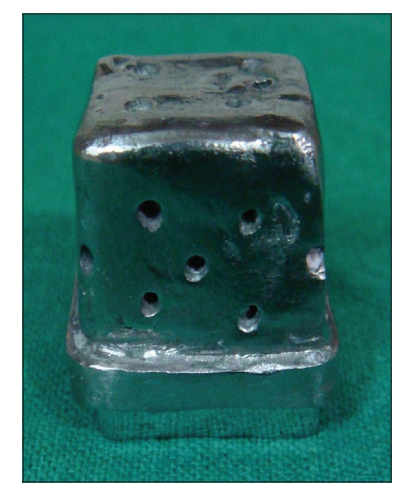
Figure 3: Custom made impression tray