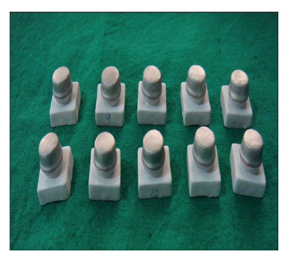
Figure 8: Direct metal laser sintered copings on the working models

microscope in micrometers and were tabulated for statistical analysis.