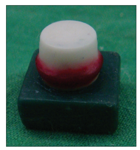
Figure 1: Wax pattern for master model

Impression of the master die was made using silicone impression material in a custom made metal tray [Figure 3]. Working model was made using die stone as shown in Figure 4. For standardization, the working models were measured mesiodistally, occlusogingivally, and