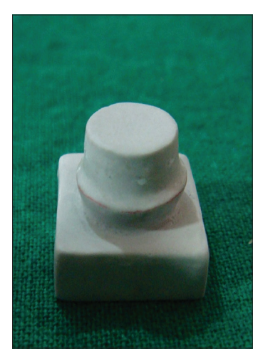
Figure 4: Working model