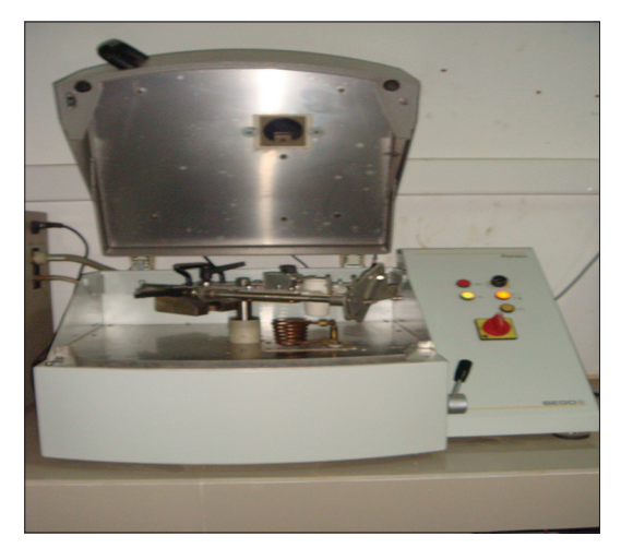
Figure 5: Casting machine (Bego, Bremen, Fornex T)