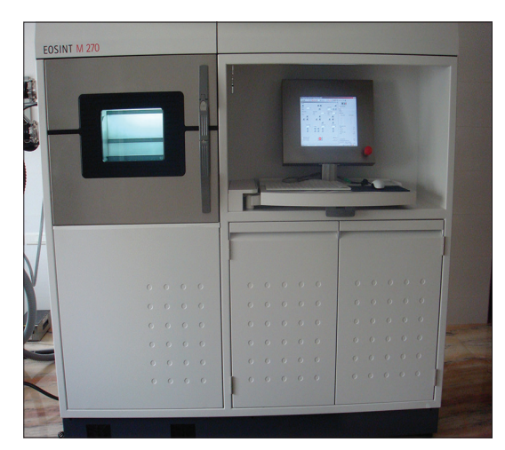
Figure 7: Direct metal laser sintering machine (EOSINT M270, EOS GmbH, Germany)

The internal gap of copings prepared by conventional and DMLS techniques was measured using metallurgical microscope (Olympus BX5, Japan) calibrated by an experienced engineer according to the manufacturer's instructions. The internal gap of copings was measured at