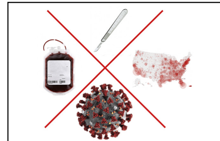
Cardiac surgery cases cancelled as blood supply jeopardized and COVID-19 cases rise.

The rapid spread of COVID-19 had a profound impact on blood donations, blood supplies, and potentially on blood safety. 3 The long, possibly asymptomatic incubation period (1-14 days) of COVID-19 has created immense challenges in procuring safe and adequate blood donations. Blood products are a critical component of emergency preparedness. In addition, the implementation of enhanced donor screening, and deferral strategies to maintain a safe donating environment, have limited the donor pool. The nationwide curtailment strategy to limit spread resulted in the cancelling of more than 4000 volunteer blood donation drives, which account for more than 80% of the blood collected by the American Red Cross, and a deficit of more than 130,000 donations in a few weeks' time. 4,5 This multifactorial impact on our nation's blood supply led to a call to action from the Director of the US Food