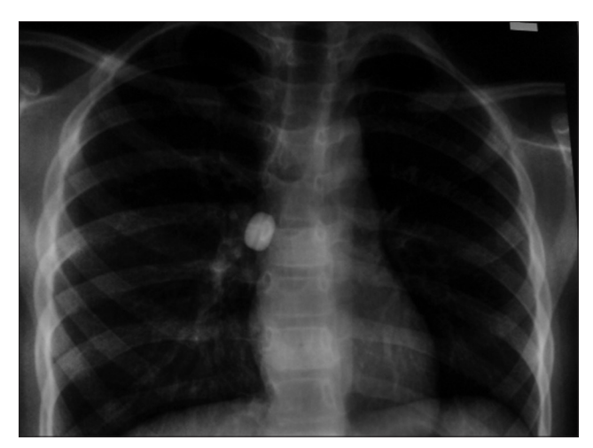
Figure 1: X-ray of the chest shows foreign body in right bronchus.