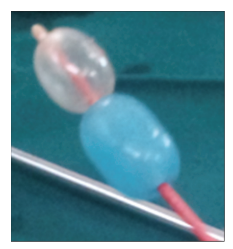
Figure 3: Foreign body removed with Fogarty catheter through bead.

Clinically, they may present with cough, unilateral wheeze, and decreased breath sounds which seen in only 65% patients. Any patient with a positive history, classical symptoms, or