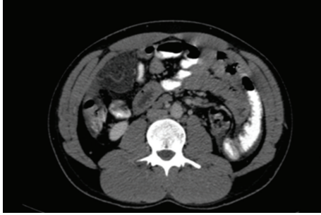
FIGURE 1: CT scan showing increased fat density mass in the upper quadrant.

investigations showed a white cell count of 11,800 /mmc with 65.5% polymorphonuclear cells, HB: 15.2, and ESR 15 mm/hr. Amylase was within normal range. Abdominal plain film and erect chest radiographs showed no active disease. The urine analysis was normal. Abdominal ultrasonography showed a small amount of free fluid noted in the Morison's pouch infrahepatic without any other abnormalities. Computed tomography of the abdomen was performed and showed inflammatory changes and increased fat density mass in right upper-quadrant measuring 5 × 4 cm representing focal panniculitis (Figure 1). Free fluid was noticed in the infrahepatic and both paracolic gutters as well as around the appendix.