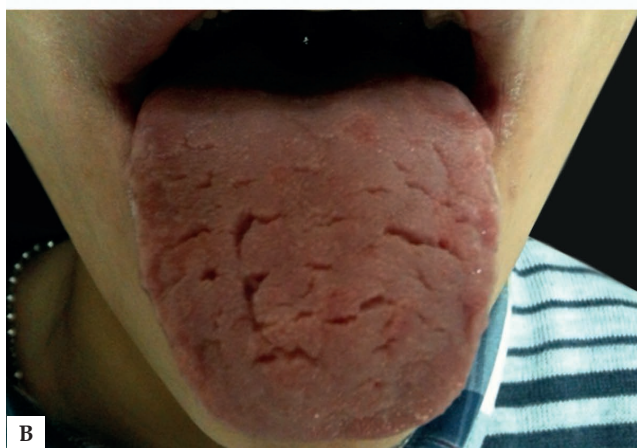
FIGURE 5: Patient 2 at 5-month follow-up. A: Mild lip swelling, with dry lips. B: Fissured tongue persisted; geographic tongue has a milder expression