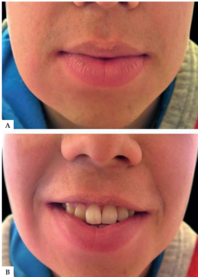
FIGURE 3: Patient 1 at 18-month follow-up. A: Asymmetrical lower lip swelling, with soft tissue enlargement of right cheek. B: Slight asymmetrical smile

The exact etiology of idiopathic OFG remains unknown. Current knowledge suggests a multifactorial relation between the immune system, environmental exposure and genetic susceptibility. 10 Up to 80% have an IgE-mediated clinical allergy (e.g., hay fe-