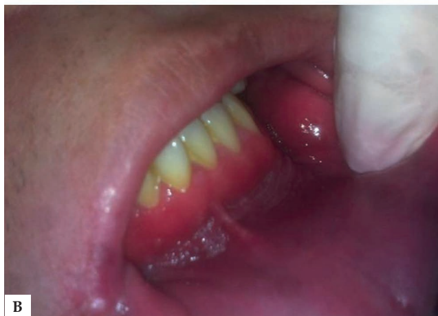
FIGURE 1: Patient 1 at his first consultation. A - Evident symmetrical lower lip swelling and angular cheilitis. B - “Full-width” gingivitis