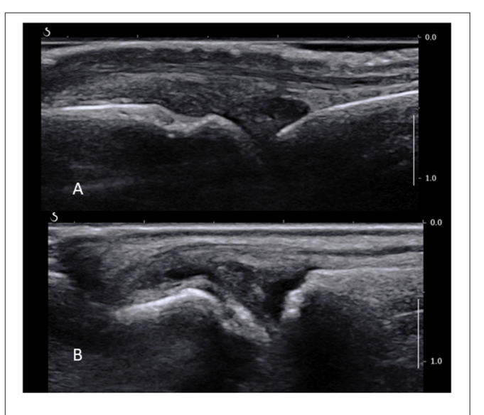
FIGURE 2 | (A) Normal MCP joint on a longitudinal ultrasound view. Note the joint space, metacarpal head, proximal phalanx, and extensor tendon. (B) Long axis ultrasound scan of a fifth MTP joint showing synovial thickening proximally to the joint line overlying the metatarsal head, as well as a small amount of fluid.

downwards. An absorbent pad is placed on the table. Significant arm elevation and/or abduction should be avoided and the bed should be moved instead. After wearing a mask and hear cover, the operator proceeds to hand disinfection and then wears a