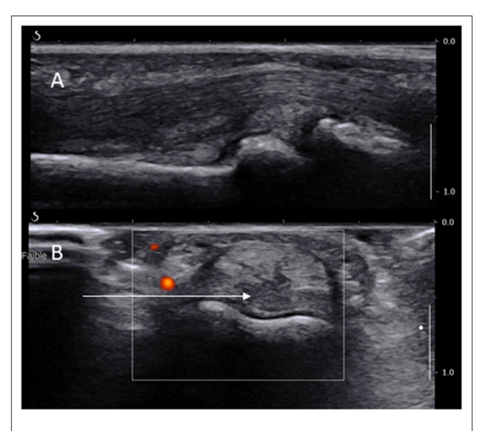
FIGURE 3 | Long (A) and short (B) axis views of a PIP joint showing the long axis of the needle path (arrow) dorsally to the digital artery.

Keeping continuous hand- patient skin contact is preferred by some operators for a better control of the biopsy needle.