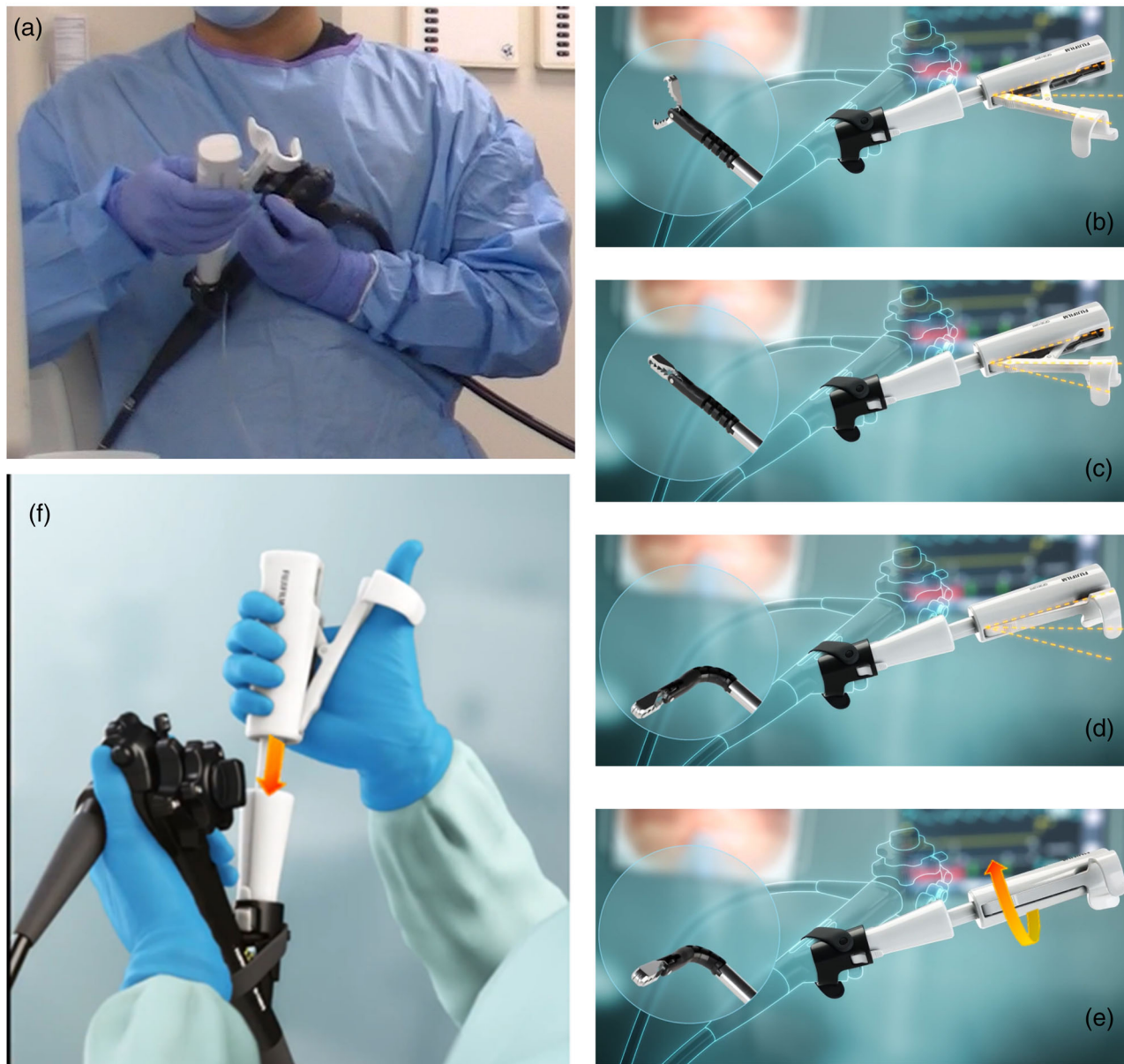
FIGURE 2 The traction device used in this study (Tracmotion; Fujifilm, Lexington, MA, USA) is a single operator, a through-the-scope device with 360° rotatable grasping forceps that can be opened and closed repeatedly to allow tissue manipulation and traction during submucosal dissection (a). The opened handle position opens the jaws of the grasping forceps (b). Closing the handle halfway results in the closure of the jaws of the grasping forceps (c). A fully closed handle bends the grasping forceps towards a 90-degree angle (d). Rotation of the handle translates into rotation of the grasping forceps (e). Pushing down on the handle (arrow) further extends out the grasping forceps (f).

3.7 mm or larger instrument inner channel diameter and a working length of 1030 mm.