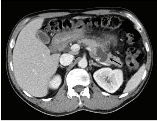
FIGURE 1: 4.1 cm pancreatic pseudocyst in distal pancreatic body (marked by arrow).

fluid revealed it to be exudative with a fluid amylase level of >2000 units/L. Fluid cultures grew Klebsiella pneumoniae and a culture-directed course of antibiotics was prescribed. In view of the high pleural fluid amylase levels, a diagnosis of a PPF was made and he was given octreotide 100 mcg 8-hourly subcutaneously for 5 days. The pleural drain was left in situ for 7 days and it drained 2.5 litres of haemoserous fluid in total prior to removal.