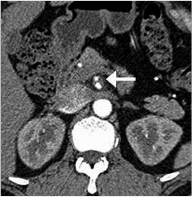
Figure 2: Axial, arterial-phase, contrast-enhanced, CT scan shows superior mesenteric artery dissection (arrow) with patent true and false lumens

Although dissection can be seen with the help of Doppler USG, CT angiography is a more appropriate investigation for the demonstration of the dissection flap, the thrombus (if