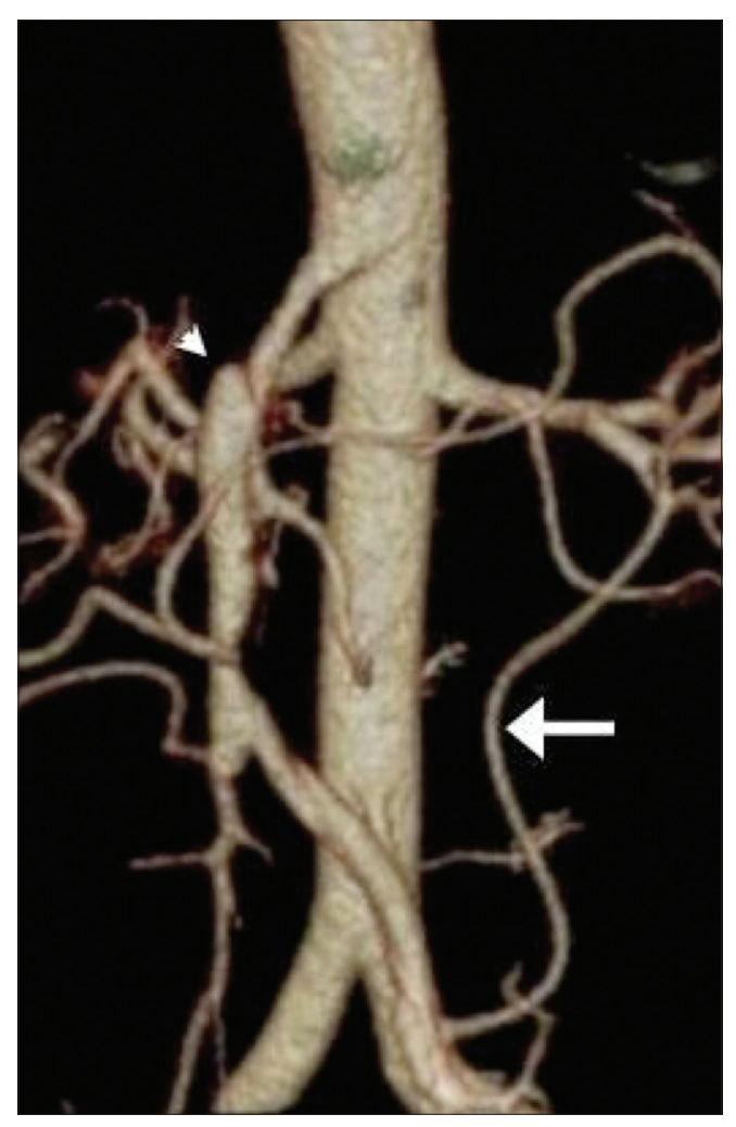
Figure 3: Frontal, volume rendered 3DCT reconstruction demonstrates an enlarged superior mesenteric artery lumen (arrowhead) with dissection and the artery of Drummond (arrow)