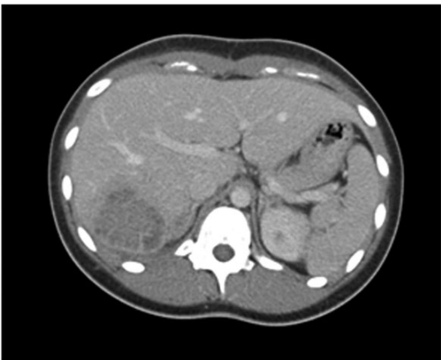
Figure 2: CT scan showed a large multi-septated liver abscess in the right lobe of the liver (Case 2).

family history of TB. CT abdomen showed a 4.5-cm low attenuation lesion in the caudate lobe, compressing the hepatic artery (Fig. 3). EUS biopsy revealed necrotizing granulomatous inflammation. Although Zeil–Neelson stain was negative, culture showed Mycobacterium tuberculosis at 4 weeks. CT thorax was done, immunoglobulins measured and human immunodeficiency virus (HIV) status checked for the three patients who responded well and promptly, clinically and radiologically to a standard multi drug anti-tubercular treatment regimen given for 6 months.