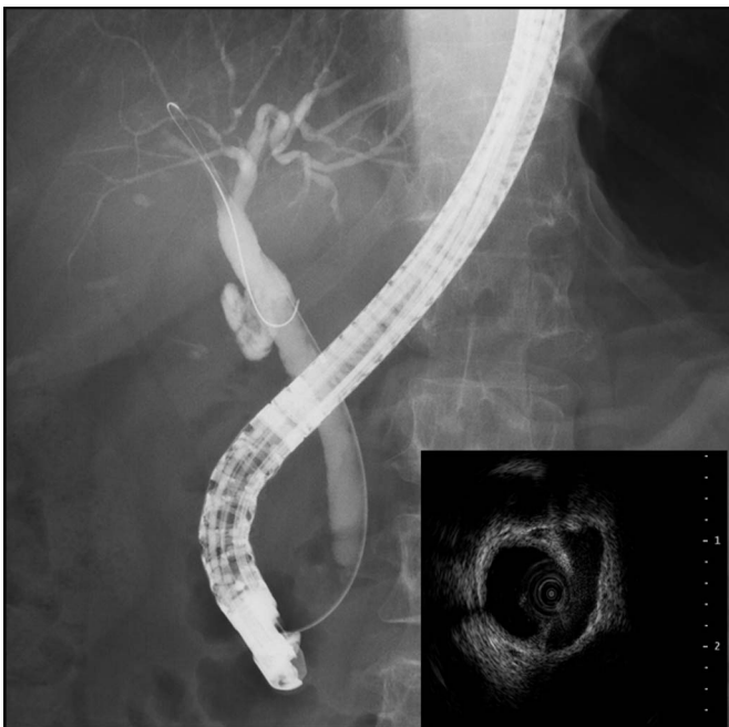
Figure 2. Endoscopic retrograde cholangiography demonstrating no biliary abnormalities. Intraductal ultrasound indicated uniform wall thickening toward the papilla from the hilar, but no biliary pancreatic duct confluence abnormalities.

endoscopic retrograde cholangiopancreatography. Endoscopic ultrasound revealed diffuse gallbladder and CBD wall thickening. No biliary stricture that suspects cholangiocarcinoma was noted on endoscopic retrograde cholangiopancreatography, and intraductal ultrasound indicated diffuse CBD wall thickening (Figure 2). On biliary biopsy of the CBD, marked infiltration of eosinophilic cells, which accounted for more than 60 cells per high-power field, was observed in addition to abundant lymphocytes and plasma cells within the biliary