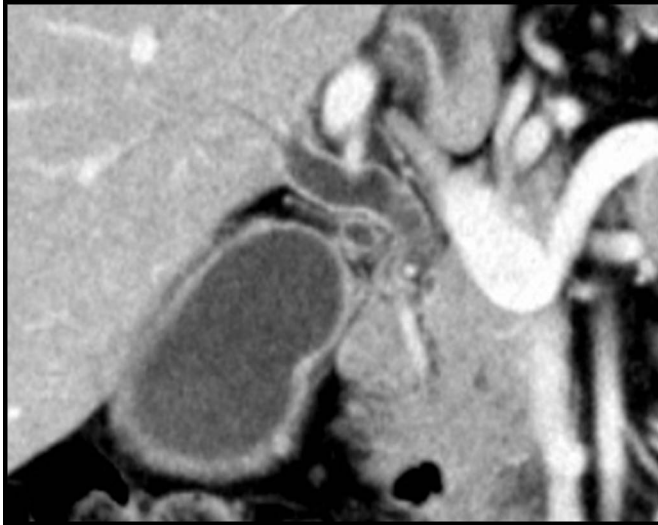
Figure 1. Contrast-enhanced computed tomography of the abdomen showing diffuse wall thickening, and contrast enhancement of the common bile duct and gallbladder without radio-opaque stones.

endoscopic retrograde cholangiopancreatography. Endoscopic ultrasound revealed diffuse gallbladder and CBD wall thickening. No biliary stricture that suspects cholangiocarcinoma was noted on endoscopic retrograde cholangiopancreatography, and intraductal ultrasound indicated diffuse CBD wall thickening (Figure 2). On biliary biopsy of the CBD, marked infiltration of eosinophilic cells, which accounted for more than 60 cells per high-power field, was observed in addition to abundant lymphocytes and plasma cells within the biliary