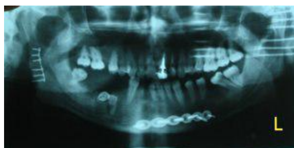
Fig. 4: Postoperative panoramic view

The advantages and disadvantages of various approaches used for management of subcondylar fractures have been previously evaluated [5]. Closed reduction with intermaxillary fixation is a non-invasive approach widely used to treat condylar and subcondylar fractures. It poses a minor danger to the facial nerve and leaves no scars. Some complications may arise in closed reduction such as inappropriate vertical high that may lead to malocclusion, improper anatomical reduction, and weight loss because of intermaxillary fixation. Another issue is the duration of maxillomandibular fixation; it may vary from 2 to 6 weeks (a two-week rigid fixation followed by elastic fixation in case of malocclusion). Surgeons prefer short fixation periods to avoid problems such as TMJ ankylosis. Trauma to the TMJ capsule can also induce TMJ ankylosis. This complication of the closed reduction approach compelled surgeons to seek new methods to treat fractures [5]. In the Shirani method, the surgeon makes an intraoral incision with a low risk of facial nerve damage and without any residual scars. Intraoral access to the fracture site by the Shirani method is more difficult compared to the extraoral approach. The advantages of this new method over the closed reduction include direct access to the fracture site, improved alignment of the fractured bones, satisfactory mandibular and TMJ function, suitable postoperative occlusion and short-term maxillomandibular fixation.