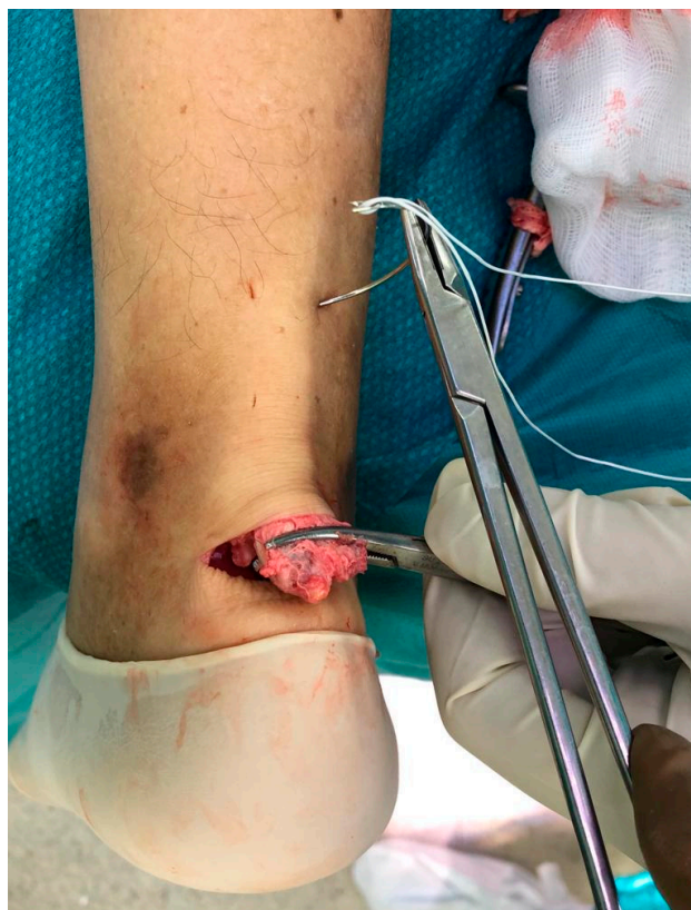
Figure 2. A loop of Ultrabraid is passed transversely between the proximal tendon bulk using a Mayo needle.