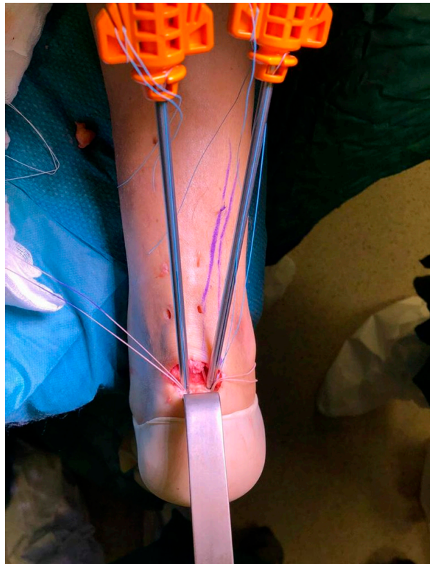
Figure 4. Two suture anchors with their cannulas inserted in the calcaneus bone.

One double loop of Ultrabraid was passed inside the guidewire of the medial anchor. The same procedure was also applied for the lateral anchor with the other double loop of Ultrabraid. After unhooking the retention suture from the inserter handle and pulling to lock the suture by the handle, the retention suture was discarded before applying tension. The same passages were performed for the other anchor. After the application of the right tension, the sutures were blocked simultaneously. The tendon was fixed, therefore, to the calcaneal insertion with suture anchors, realizing a large tendon–bone interface. For the final suture, a Vycril Rapide zero–four wire (Polyglactin 910 braided absorbable suture; Johnson & Johnson, Brussels, Belgium) was employed. Lastly, a strip was utilized and a bivalve removable scotch cast in complete plantar flexion was positioned. Full weight-bearing was provided the day immediately post-surgery, with the cast in complete plantar flexion.