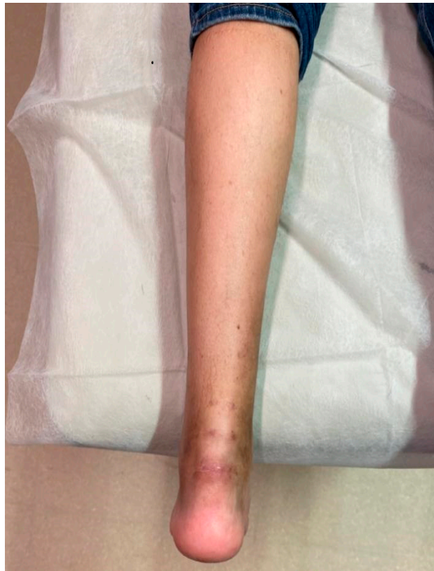
Figure 5. Follow-up at three months.