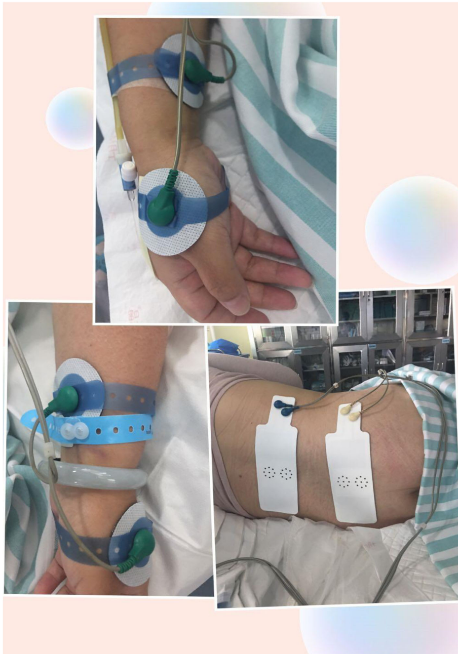
Fig. 1 Electrode placement

intervention used the following procedures: 1) a midwife and a researcher entered participants' demographic and obstetrics information into a TENS unit system before the intervention; 2) the midwife applied two pairs of electrodes on both arms at hegu points (LI4, the mid-point between first and second carpal bones, first web space dorsal side) and neiguan points (PC6, 4 cm above the medial transverse line in wrist); 3), the midwife placed two electrodes over the participants' paravertebral regions at the T10–L1 and S2–S4 levels (Fig. 1); 4), two