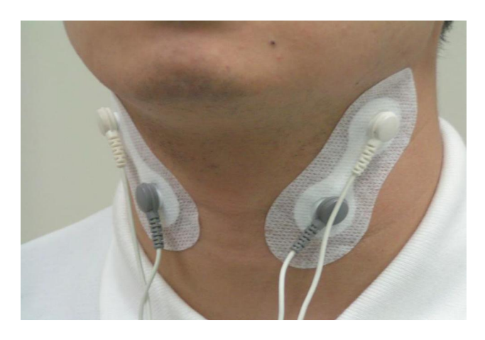
Figure 2 Positions of electrodes. The upper electrodes are placed directly below the mandibular angle, and the lower electrodes are placed at the level of the thyroid cartilage along the anterior edge of the sternocleidomastoid muscle. A 50-beat interferential wave is generated from two different alternating currents (2000 or 2500 Hz).

which was used to indicate the obesity status, and the results of the mini nutritional assessment (MNA) were used as indicators of nutritional state. The MMSE was used to assess cognitive function.<sup>17</sup> In addition, the Barthel index (BI) was used as an index of activities of daily living.<sup>18</sup>