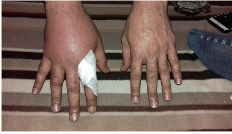
FIGURE 1: Swollen right hand with redness. This led to a diagnosis of cellulitis.

A diagnosis of infective endocarditis was made, and after blood cultures were drawn, he was started on intravenous ceftriaxone (2 g q24 h), gentamicin (70 mg q12 h), and vancomycin (1 g q24 h). A transesophageal echocardiography (TEE) showed that the aortic valve had a large 1.2 \times 1 cm mobile mass attached to the left coronary cusp, which was perforated and destroyed, with severe aortic regurgitation. The mitral valve had a small 0.5 \times 0.5 cm mass attached to the tip of the anterior leaflet, with moderately severe mitral regurgitation.