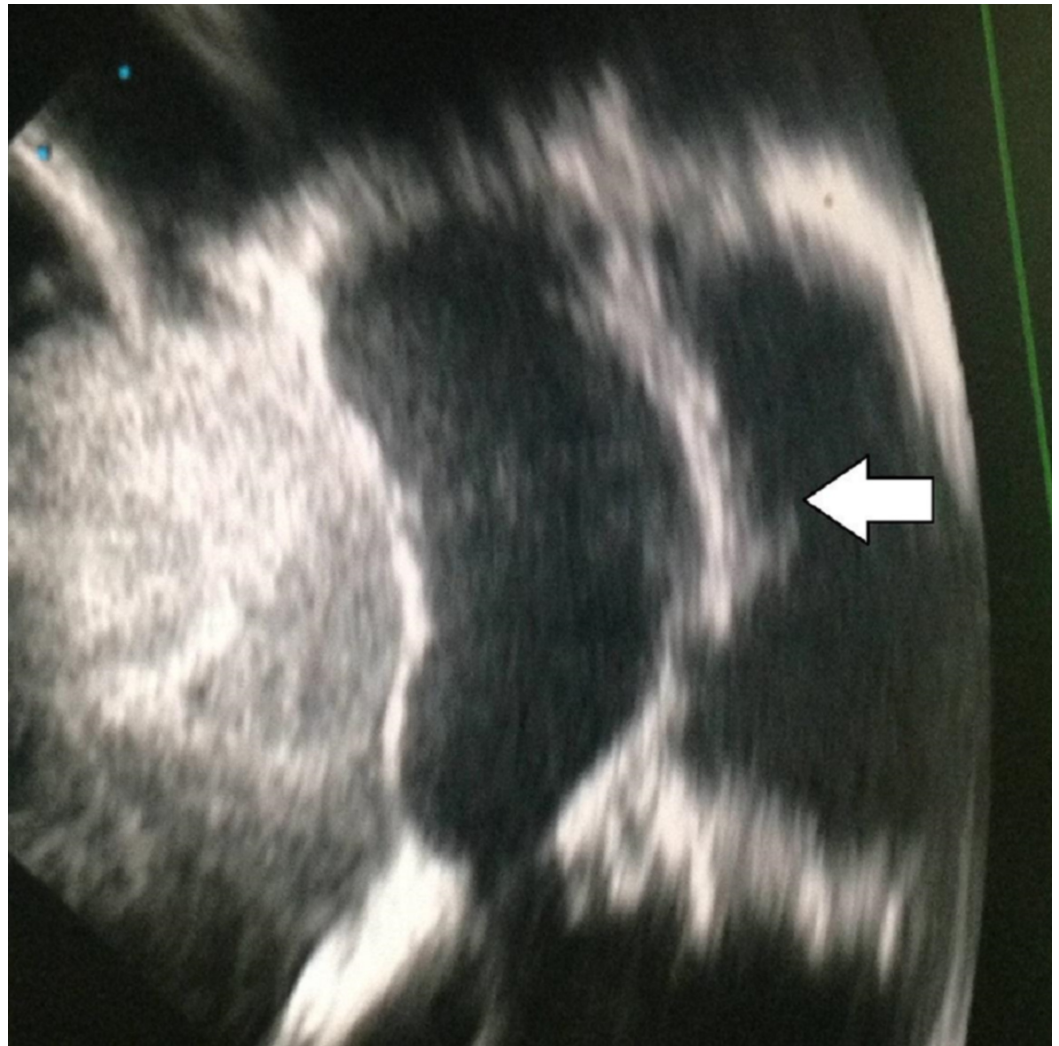
FIGURE 1: Echocardiographic image showing the transverse band in the left ventricular chamber

Anti-failure management started with loop diuretics, thiazides, and digoxin for one month, and the patient was prepared for open heart surgery to remove the band and restore the single cavity morphology of the LV. Under general anesthesia, surgery was performed through a median sternotomy approach, aortocaval cannulation, aortic cross-clamp, and cardioplegic arrest. A conventional left arteriotomy incision and entering the LV via the mitral valve was performed. A clear transverse fibromuscular band was seen tethered to the anomalous papillary muscle, which lacked the usual anatomy of separate anterior and posterior components. Using fine scissors, we excised the fibromuscular band and separated it from the papillary muscle (Figure 2). It was inevitable to cut the anomalous single papillary muscle, which was matted to the anomalous fibromuscular ridge.