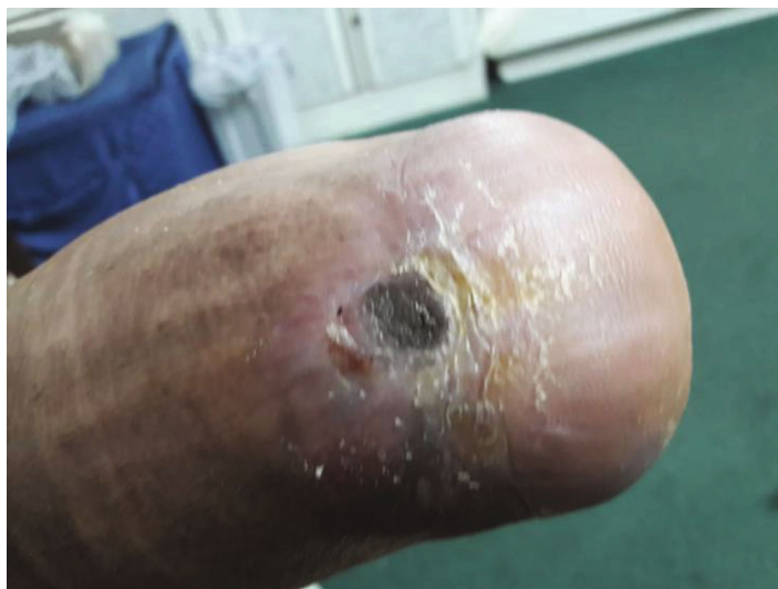
FIGURE 10: Wound completely closed after Nanoflex powder.