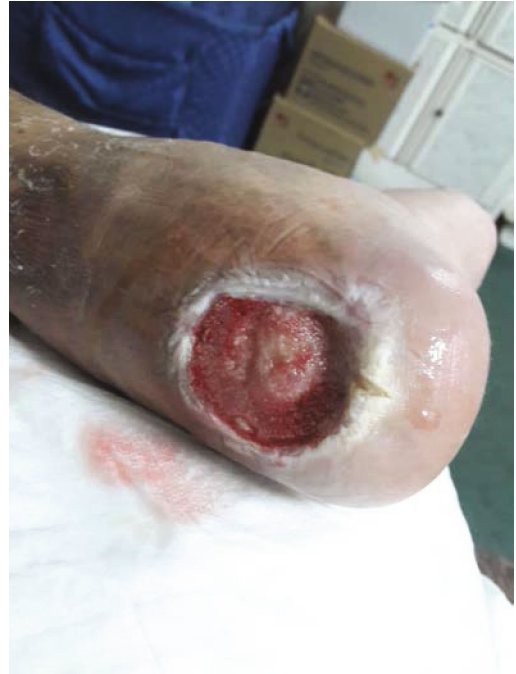
FIGURE 7: Granulation tissue developed after VAC.