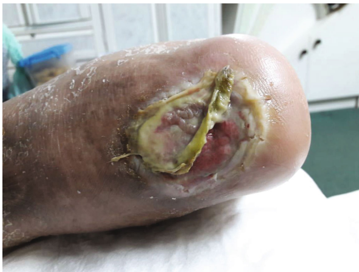
FIGURE 8: Failed skin graft after application.