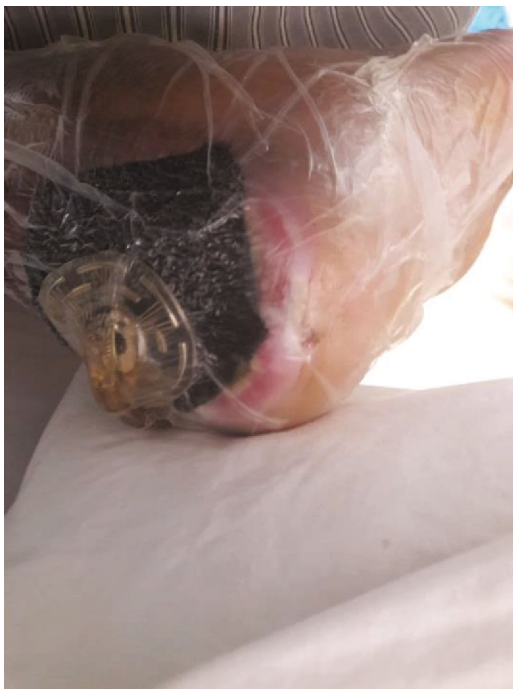
FIGURE 6: NPWT application.

The wound was seen by the plastic surgery team and planned for coverage using a split-thickness skin graft, which later failed after one week due to infection, although culture before the procedure was negative (Figure 8).