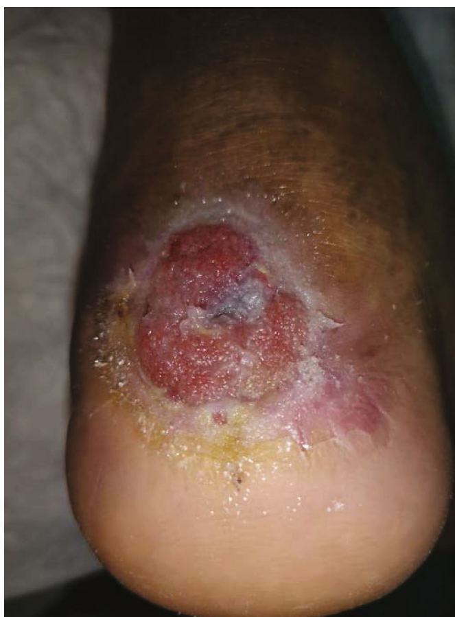
FIGURE 9: Nanoflex powder application.

endocrinologist for proper glycemic control, diabetic foot surgeon and plastic surgeon for wound coverage, vascular surgeon for vascular complications and, lastly, infectious disease specialist for optimum antibiotic treatment. Chronic