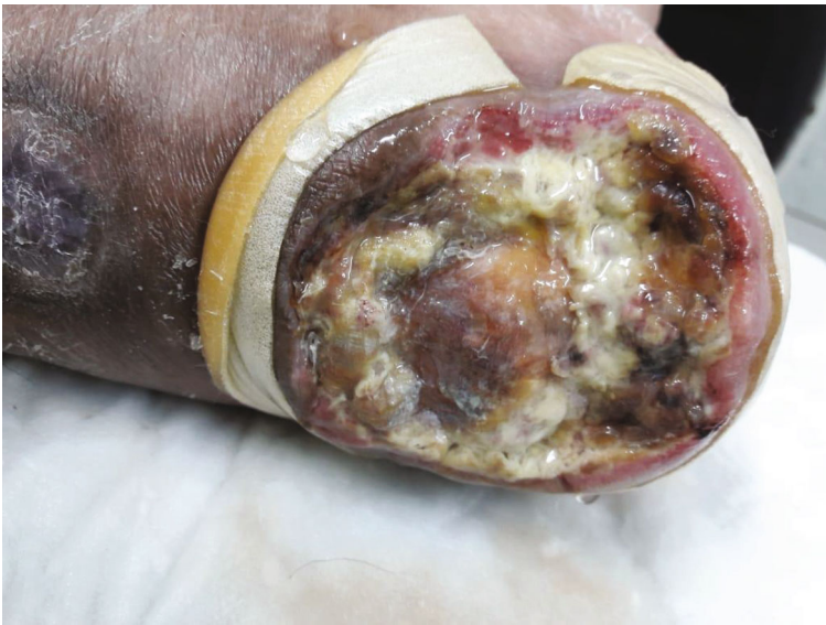
FIGURE 3: Distal wound progressively increasing in size.