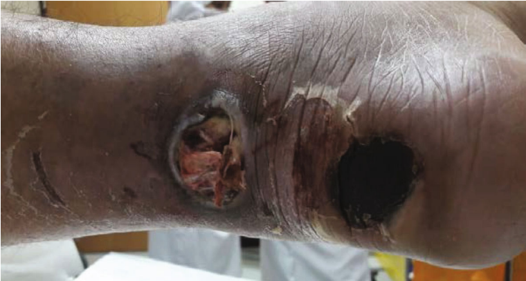
FIGURE 2: Wound presentation.