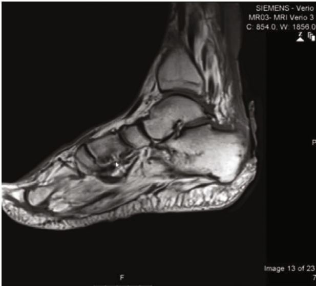
FIGURE 5: Lateral MRI view of left foot.