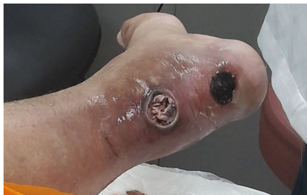
FIGURE 1: Wound presentation.

2.3. Provisional Clinical Diagnosis. The patient was provisionally diagnosed with localized deep tissue infection and abscess formation resulting in rupture of the Achilles tendon of the left lower limb.