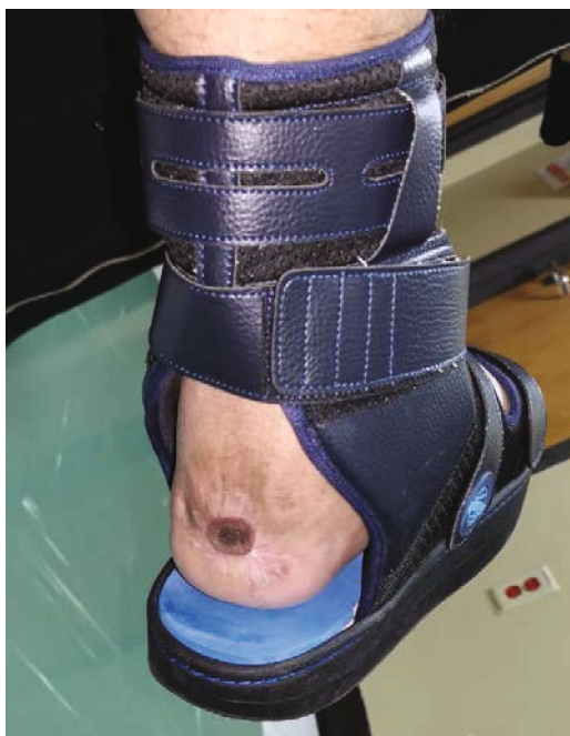
FIGURE 11: Rigid ankle brace was used to stabilize the ankle.

devascularization, infections, neuropathies, and prolonged decubitus. Like in our case, several factors can contribute to the etiology of chronic leg ulcers and can significantly delay wound healing [22]. In our case, the patient underwent several sessions of debridement for osteomyelitis. Also, a split-thickness skin graft was done, although it failed within the first week of application. After that, NPWT was reapplied for five days, and then lastly, we transitioned to Nanoflex crystals dressing as our last solution in dealing with the patient. However, we cannot always go with skin grafts as initial management when dealing with a patient with multiple comorbidities.