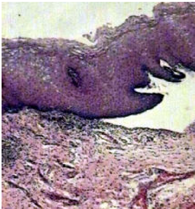
Figure 2 Subepidermal bullae. Dermis shows perivascular inflammatory infiltrates containing eosinophils and neutrophils (HE, original magnification \times 100 ).

The overall features were suggestive of mucous membrane pemphigoid. In the absence of immunofluorescence studies, in this case, the diagnosis was firmly based on a classic clinical presentation of MMP: severe vesicles, erosions and crusts on mucous membranes, typically affecting the oral cavity and eyes [3]. A direct immunofluorescence test could not be done because the patient was a prisoner and