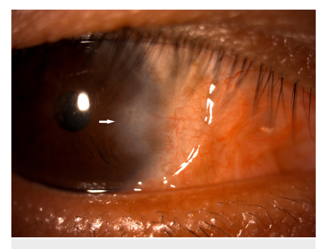
FIGURE 3: Corneal scarring nasally after two years of surgery.

Topical steroids were stopped; lubricants and antibiotics were continued. A systemic workup showed no underlying connective tissue disorder. Slit-lamp examination revealed poor tear flow to the area of dellen. This was attributed to mild graft edema nasally, which prevents tears from reaching the nasal cornea over the dellen. Option of temporary punctal plugs was discussed with the patient, but the patient refused the same for monetary reasons. Thermal punctal cautery was then applied under topical anesthesia to both the upper and lower puncta to achieve punctal occlusion. After five days, the dellen resolved with complete healing. Two years after the surgery, eye examination showed nasal corneal scarring with no recurrence without much epiphora (Figure 3).