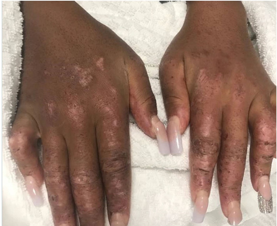
FIGURE 2: Patchy scaling rash of the hands consistent with a discoid rash