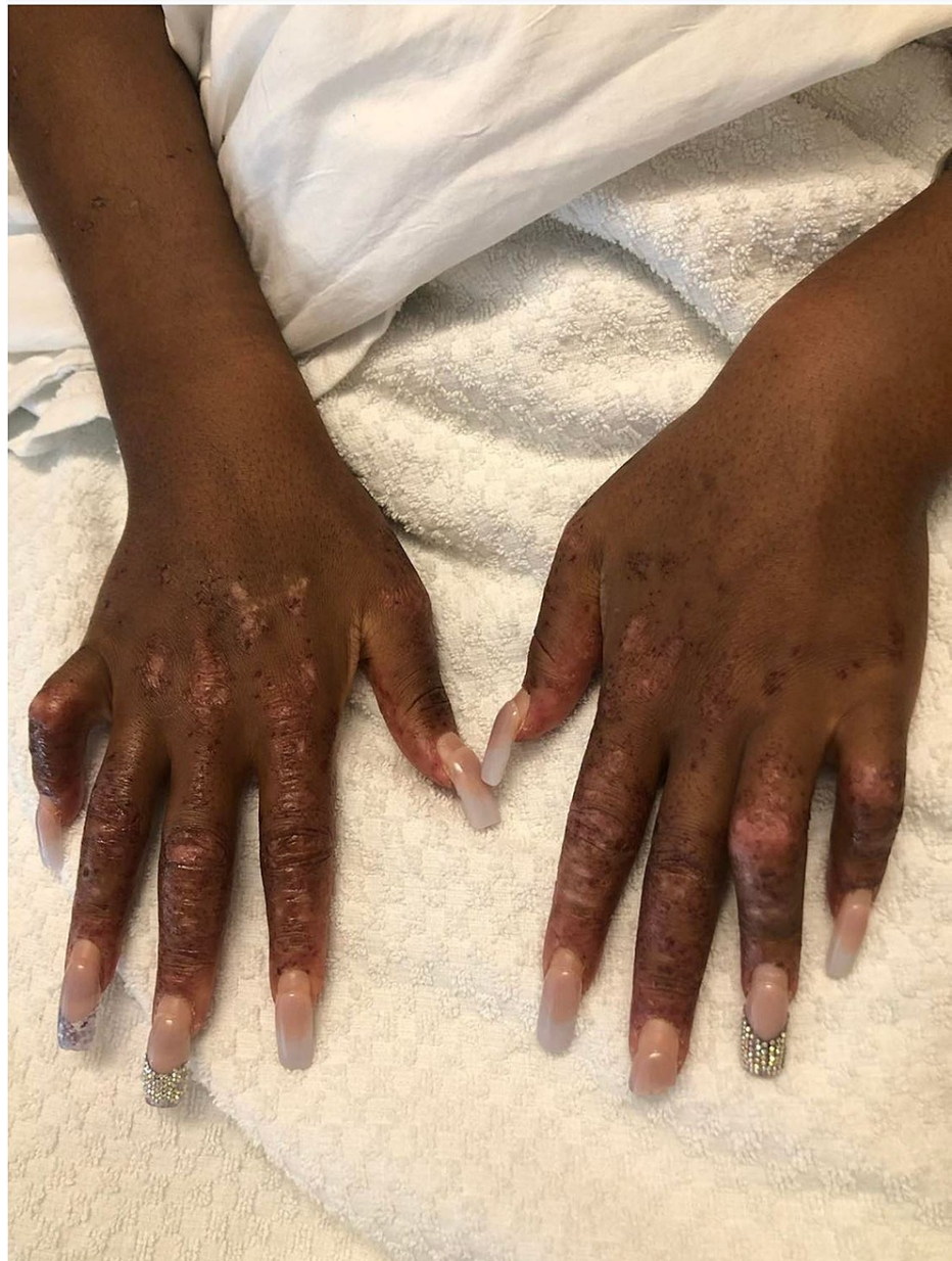
FIGURE 6: Discoïd rash of the hands improving after methylprednisolone treatment