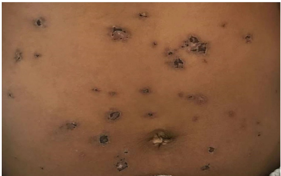
FIGURE 3: Patchy scaling rash of the abdomen consistent with a discoid rash