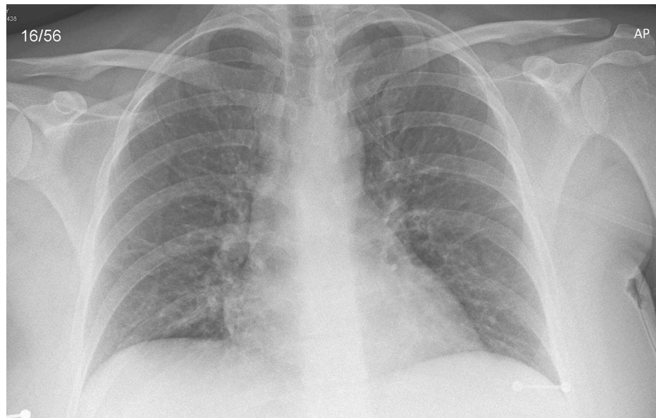
FIGURE 1: Normal chest X-ray on admission (22/09/2020)

The chest X-ray (CXR) on admission (Figure 1) was normal with no focal abnormalities. As per hospital protocol, she was swabbed for SARS-CoV-2 on admission, which, later on, was negative. She was also tested for Streptococcus pneumoniae PCR and urinary Legionella antigen, and these were also negative. A blood gas analysis on admission revealed compensated type 1 respiratory failure, and she was promptly moved to the respiratory ward for further treatment. Initial electrocardiogram (ECG) showed sinus tachycardia at 120 beats per minute with no features of ischemia or right heart strain.