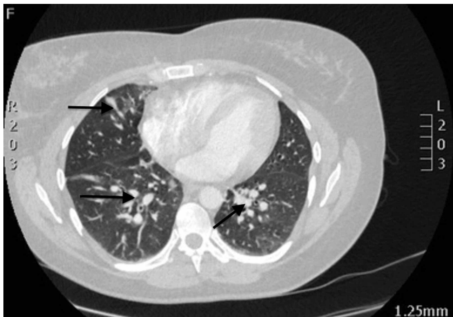
FIGURE 3: CTPA image (24/09/2020) showing multi-lobar pneumonia changes in the middle zones of both lungs (black arrows)

Given her degree of hypoxia and clinical deterioration, a CT pulmonary angiogram (CTPA) was performed overnight, revealing multi-lobar pneumonia but excluding a pulmonary embolus (Figures 3, 4). Given the worsening oxygen saturation (92% on \text{FiO}_2 60%), she was transferred to the intensive care unit (ICU) for non-invasive ventilation in the form of continuous positive airway pressure (CPAP) ventilation at 7 \text{cmH}_2\text{O} ; alongside continuing intravenous dexamethasone, antibiotics (teicoplanin and clindamycin based on microbiologist advice) were started to cover for secondary bacterial infections.