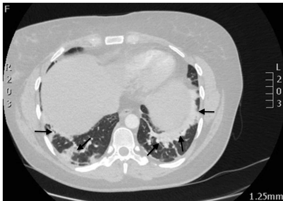
FIGURE 4: CTPA image (24/09/2020) showing multi-lobar pneumonia in the lower lobes of both lungs (black arrows)

CTPA, computed tomography pulmonary angiogram