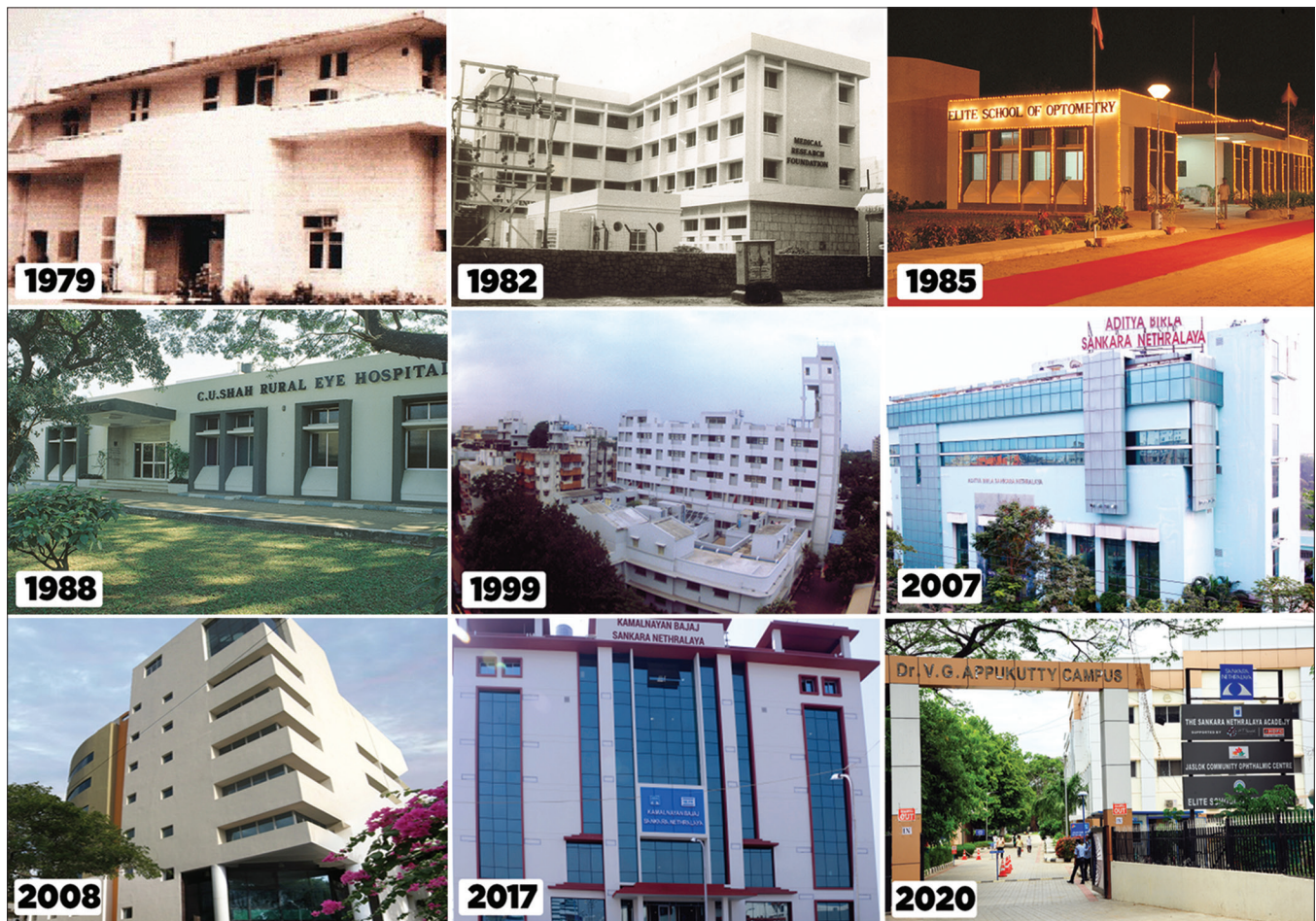
Figure 3: The evolution of Sankara Nethralaya and its branches over the years