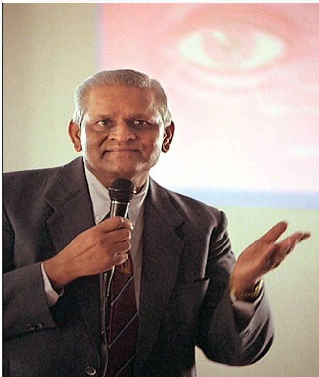
Padma Bhushan Dr. Sengamedu Srinivasa Badrinath

The current practice of ophthalmology in India owes a great debt to Dr. S. S. Badrinath's passion for science, which revolutionized ophthalmic practice by combining clinical practice, academics, community eye care, and eye research. Dr. Badrinath founded "Sankara Nethralaya" (SN), a tertiary eye care institute in 1978, to provide comprehensive eye care of highest standards to all sections of the community. It is worth mentioning that the subspecialty practice in ophthalmology was nearly nonexistent in the year 1978. Due to Dr. Badrinath's vision to develop separate subspecialties within ophthalmology, he could create a team of highly skilled professionals who could work for a common vision.