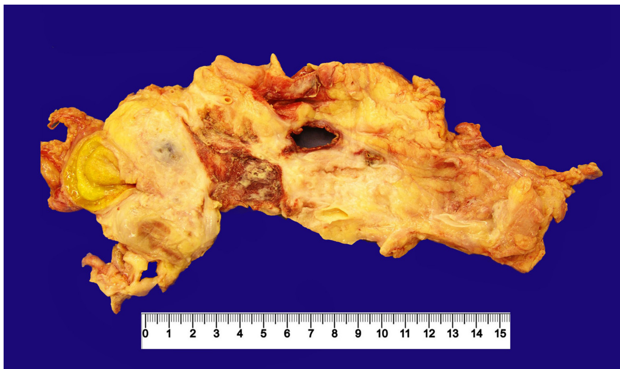
Figure 1. Gross appearance of the pancreas showing the replacement of the pancreatic parenchyma with fat tissue and, at the center, the perforation hole of the pseudocyst.

The microscopy revealed that the pancreatic parenchyma was replaced by extensive fibrosis, acinar atrophy, intraductal eosinophilic protein plugs, and chronic inflammatory infiltration (Figure 2A and 2B). The surrounding pancreatic fat tissue, as well as the whole peritoneum, was thoroughly coated with fibrin, which, at histology, confirmed the presence