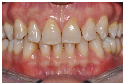
FIGURE 1: Initial intraoral situation.

Subsequently, posterior radiographs were performed to assess the presence of interproximal carious lesions, photographs were taken, and dental impressions were taken in order to make a diagnostic wax-up. At the time of the reevaluation, the presence of carious and periodontal lesions was not found. The diagnosis included the presence of diastemas between the upper front teeth, the incorrect position of the elements 12 and 22, the presence of white spots, the nonideal proportion of the elements 11 and 21, and the noncoincidence of the facial midline with the upper dental midline.