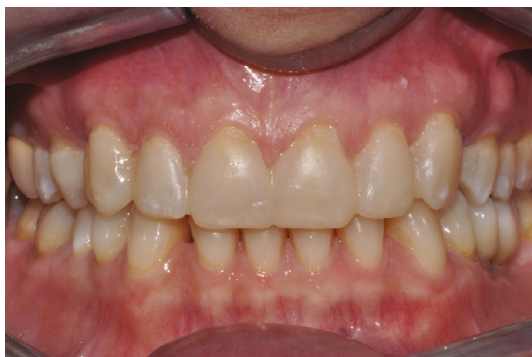
FIGURE 3: Initial mock-up.