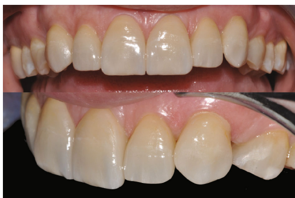
FIGURE 9: Final result with 3-year follow-up.

etched with 35% orthophosphoric acid for 30 seconds and rinsed for 30 seconds, and then the primer and the bonding were applied on without light curing. Resinous composite cement (Variolink Esthetic, Ivoclar Vivadent) was applied, the veneers were positioned on the teeth, and the cement excesses were removed.