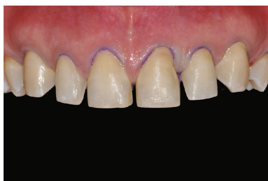
FIGURE 7: Final teeth preparation.