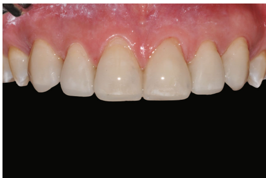
FIGURE 8: Mock-up printing on final preparations.