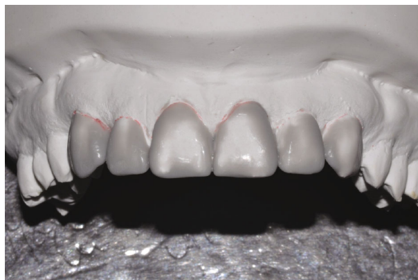
FIGURE 6: Final wax-up.