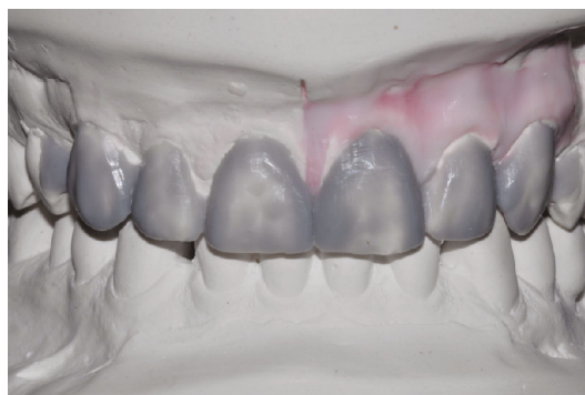
FIGURE 2: Initial diagnostic wax-up.

The treatment of the white spots could have been performed using infiltrating resin (Icon, DMG) resin with a superficial [5] or deep [6] treatment. However, the patient wanted a change not only in the color and surface texture of his teeth but also in morphology.