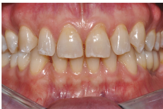
FIGURE 5: Completion of orthodontic treatment.

The cephalometric radiography study has allowed to appreciate the following: severely brachifacial growth type; 1st skeletal and dental class; poor sagittal development of the maxilla; and increased mandibular development.