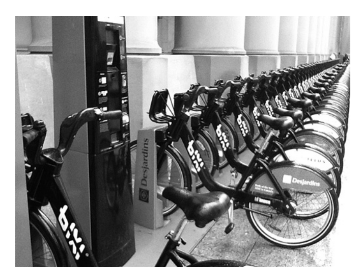
Figure 2 BIXI bike kiosk, with pay station and bike dock, Toronto, 2011.

Cyclists over 18 years of age in Toronto make the choice of whether or not to wear a bicycle helmet because helmet legislation in Ontario only applies to children. It was initially estimated that bicycle helmets decrease the risk of head injury by 85%.<sup>3</sup> More recent estimates question