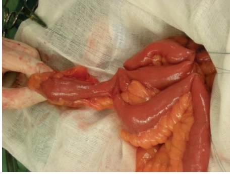
FIGURE 1: Meckel's diverticulum.