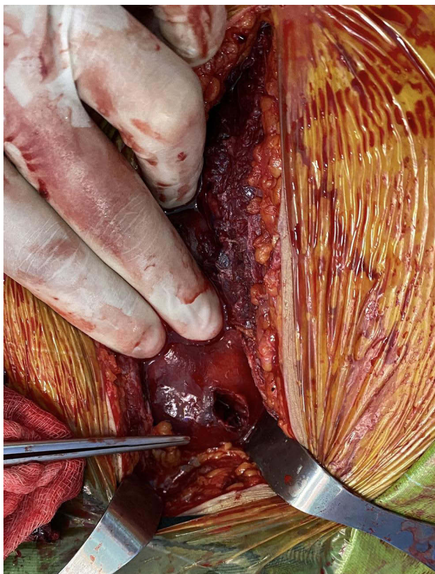
Figure 2 The wound was at the anterior lower pole.

creatinine. 5 However, Morgan (2019) performed a Doppler ultrasound of the transplanted kidney 10 min immediately after the biopsy procedure and then performed routine follow-up. 2