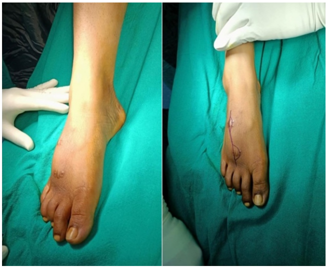
Figure 1: Pre-operative clinical image showing right dorsal foot swelling and biopsy scars over the dorsum.