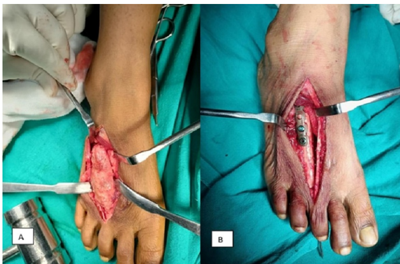
Figure 3: Intraoperative image of (A) Right dorsal foot mass (B) Fixation of fibular strut graft with recon plate and K-wire after removal of mass.

hypointense in T1 and hyperintense in T2-weighted images, along with the cortical breach in the ventral aspect of the third metatarsus. A core-needle biopsy under C-arm guidance was performed as per protocol for confirmation of diagnosis and prognostication of disease, and the sample was sent for histopathological evaluation. Under microscopy, there were large areas of hemorrhage with fibro-collagenous tissue and many giant cells with scattered hemosiderin-laden macrophages, which were suggestive of ABC. Surgical excision with autogenous fibular bone grafting was planned for the patient. A 10 cm linear incision was given in line with the third metatarsal and with the biopsy site. Skin and subcutaneous tissue were incised until the periosteum was reached. The periosteum was also incised in the