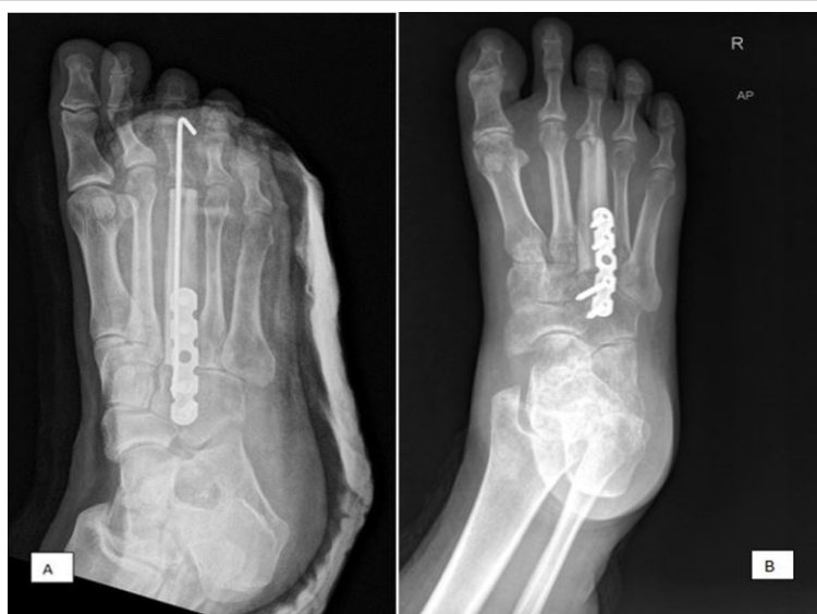
Figure 5: (A) Immediate post-operative X-ray image (B) 2-year follow-up post-operative X-ray image showing no recurrence and good incorporation of graft.

ABCs make up about 1% of all primary bone lesions that undergo biopsy [7]. While the exact cause of ABCs is not fully understood, the most widely accepted theory suggests that they result from disruptions in local blood circulation, leading to increased pressure in veins and the development of enlarged and dilated blood vessels within the affected bone [8]. It is crucial to differentiate between ABCs and other bone tumors containing giant cells, such as GCT, GCRG, and brown tumors [9]. GCTs consist of mononuclear and osteoclast-like multinucleated giant cells and can be locally aggressive.