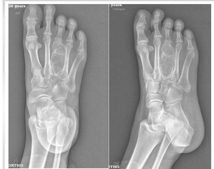
Figure 2: Pre-operative X-ray: Expansile lytic destructive lesion involving the 3rd metatarsal with significant thinning of the cortex and septations seen.

metatarsal bone, which is an uncommon presentation. Only a few such cases have been reported in the medical literature to date.