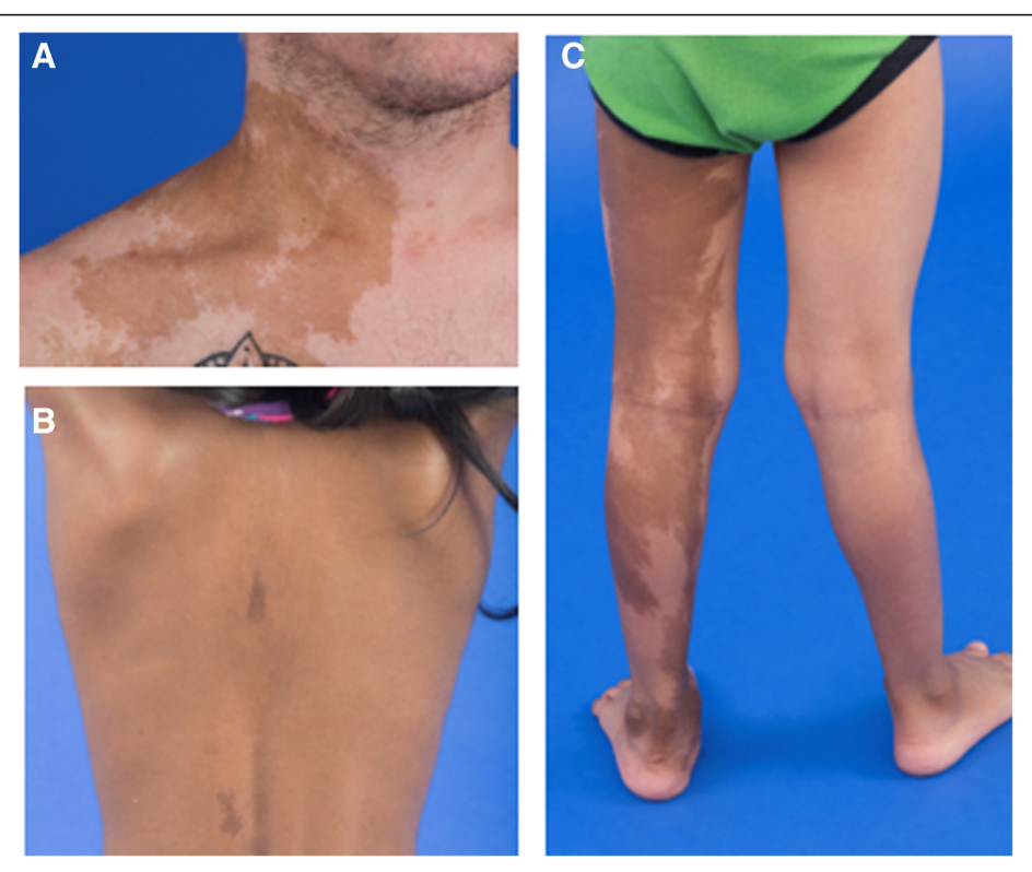
Fig. 1 Representative images of café-au-lait macules in patients with McCune-Albright syndrome. Photographs of the shoulder (a), back (b), and legs (c) from three patients demonstrating characteristic hyperpigmented lesions with jagged borders, and tendency to either occur or reflect around ("respect") the midline of the body. Images A and C show large lesions, while the patient in image B has two small lesions in a classic location, demonstrating the broad potential spectrum of involvement